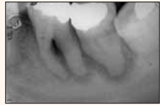
Fig. 1: Pre-op, before the PIPS.

Before each treatment the PIPs™ technique was applied into the periodontal pockets of each tooth for refining the de-