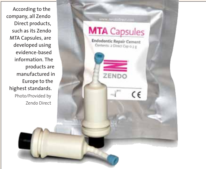
According to the company, all Zendo Direct products, such as its Zendo MTA Capsules, are developed using evidence-based information. The products are manufactured in Europe to the highest standards.

Ideal concept for clinicians who use MTA infrequently