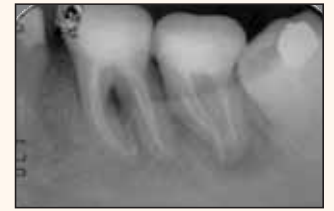
Fig. 4: Four months post-op

bridement, removal of biofilm from the root surfaces and pocket disinfection. The root canal treatments were performed using PIPS-specific irrigation protocols with 5 percent NaOCl and 17 percent EDTA.