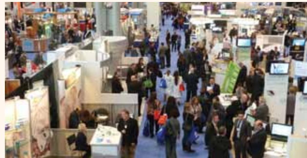
An expanded exhibit floor at the 2014 Greater New York Dental Meeting will feature more than 1,700 exhibit booths with more than 700 companies. The 2014 exhibit hall dates are Nov. 30 through Dec. 3.