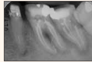
Fig. 3: One month post-op