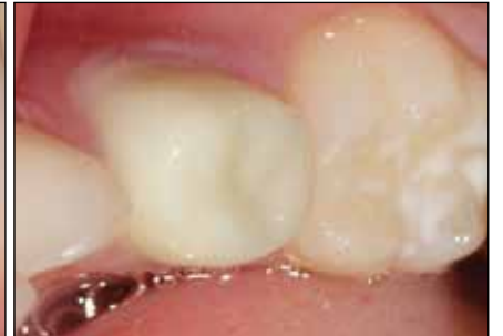
• Before-and-after photos of a restorative case using NuSmile ZR aesthetic paediatric crowns on a first primary molar.