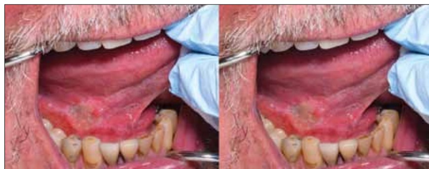
• An example of the left-eye and right-eye photos that Dr. Samson Ng uses to create a single 3-D image. Depicted is an early invasive squamous cell carcinoma at the right ventral tongue, revealing the ulceration and the indurated border of the invasion at the edge of the ulcer. In 3-D, the induration is much more clearly defined.