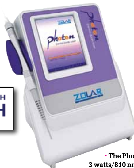
• The Photon, 3 watts/810 nm.