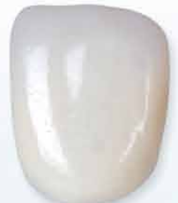
Final BruxZir or IPS e.max crown