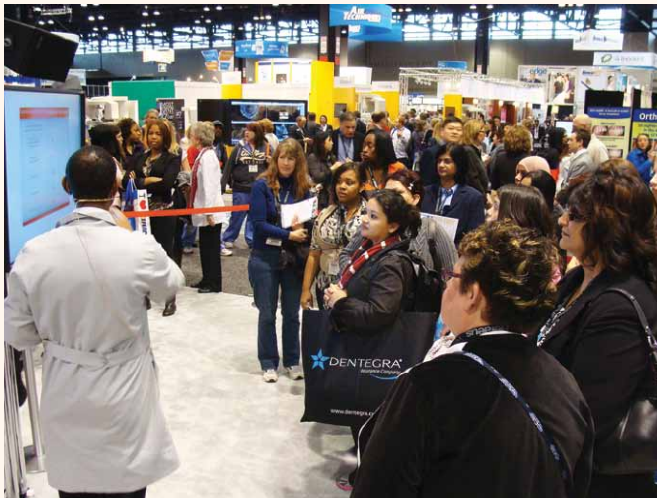
Dental hygienists receive information on oral-care products at the Colgate booth (No. 1818).