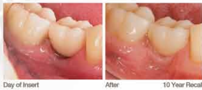
Captek Crown on 2nd molar, with endo treatment, and 1st molar over implant abutment.