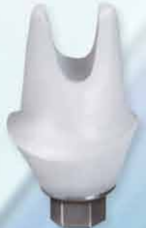
Final custom abutment