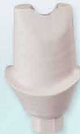
Custom temporary abutment