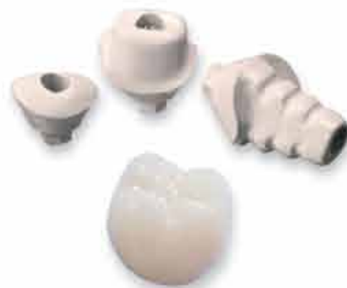
BioTemps® Implant TCS (Tissue Contouring Solution) custom components to ensure ideal soft tissue contours included