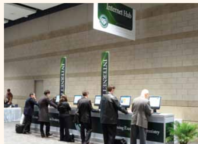
Attendees take advantage of the Internet Hub to catch up on electronic communications.