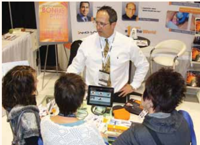
Meeting attendees stop by AMD LASERS (booth No. 1434) to get more information on affordable laser technology.