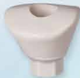
Custom healing abutment