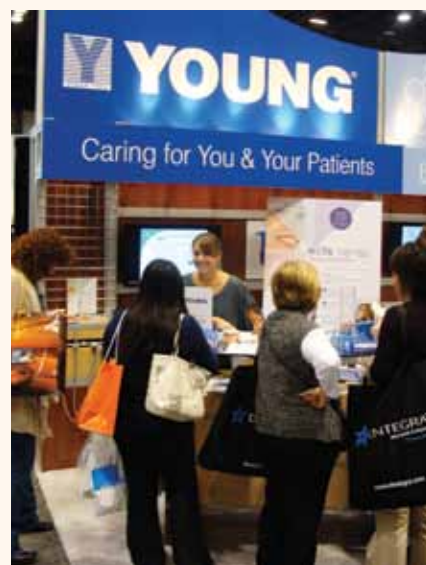
Meeting attendees visit the booth of Young Dental Mfg. Co. (No. 3822).