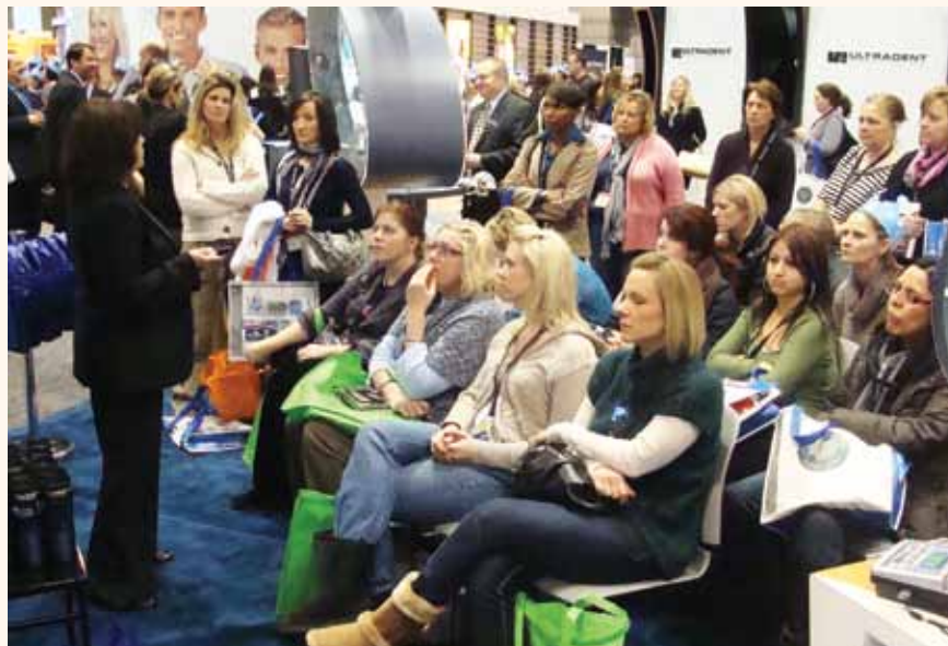
Meeting attendees take in an educational presentation at the ViziLight booth (No. 4425).

At Shofu Dental Corp. (booth No. 4025), lots of dentists are clamoring for the BEAUTIFIL Flow Plus injectable hybrid restorative for all indications.