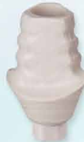
Custom impression coping