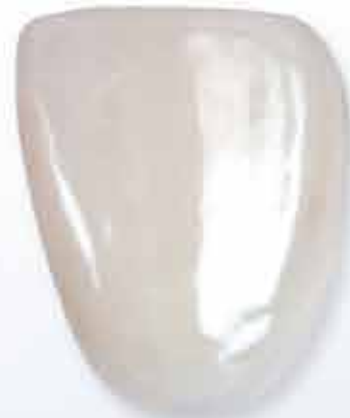
BioTemps provisional crown