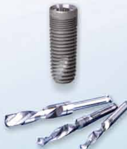
Inclusive® Tapered Implant and required drills included