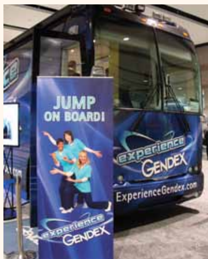
Hop aboard the Gendex bus, located near the entrance to the exhibit hall.