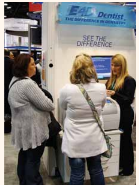
Meeting attendees visit the Henry Schein booth (No. 2314) to get more information on E4D technology.