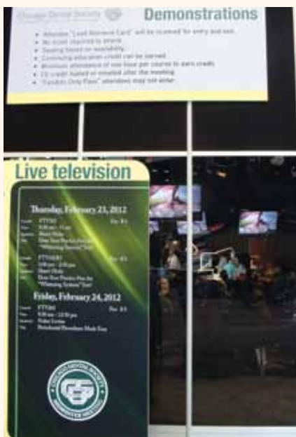
To enhance your clinical knowledge, step inside the live dentistry theater.