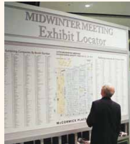
If you're not exactly sure where to go, you can look it up on the map of the show floor.