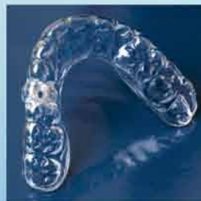
Prosthetic guide for ideal restorative placement included