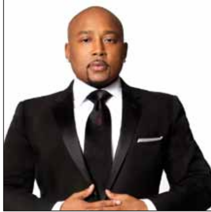
• Daymond John, star of ABC's 'Shark Tank,' will be the special guest speaker at today's first SIROWORLD Celebration event, being held at the TimesCenter in the Times Square District.