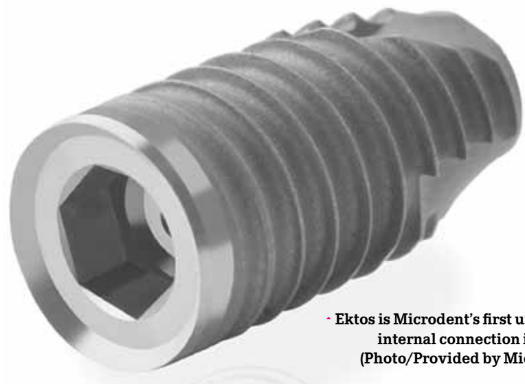
• Ektos is Microdent's first universal internal connection implant.

campaign in print and online," Muñoz said. "And will be providing free online implant courses through the Dental Tribune Study Club to show