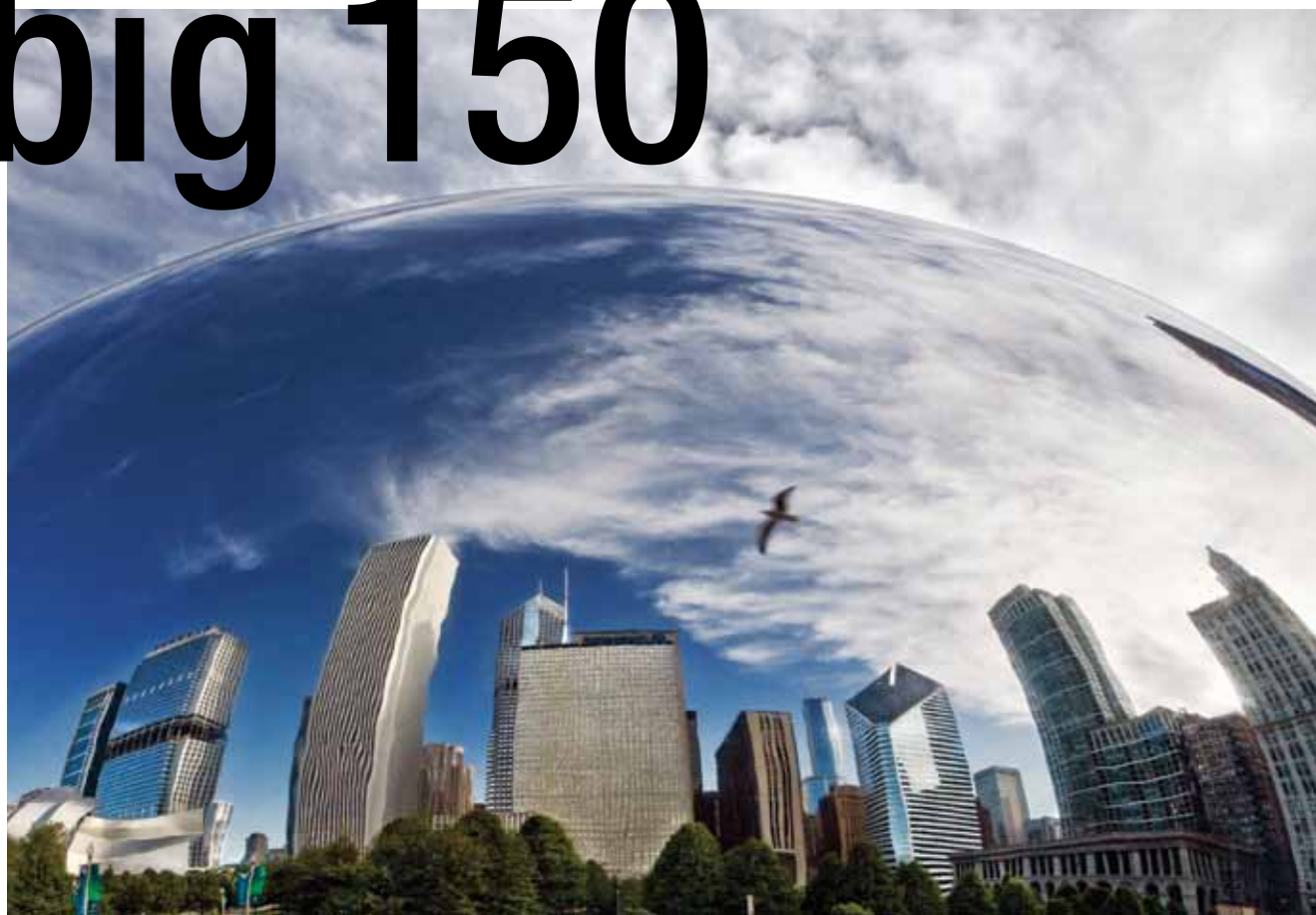
Cloud Gate at Millennium Park.