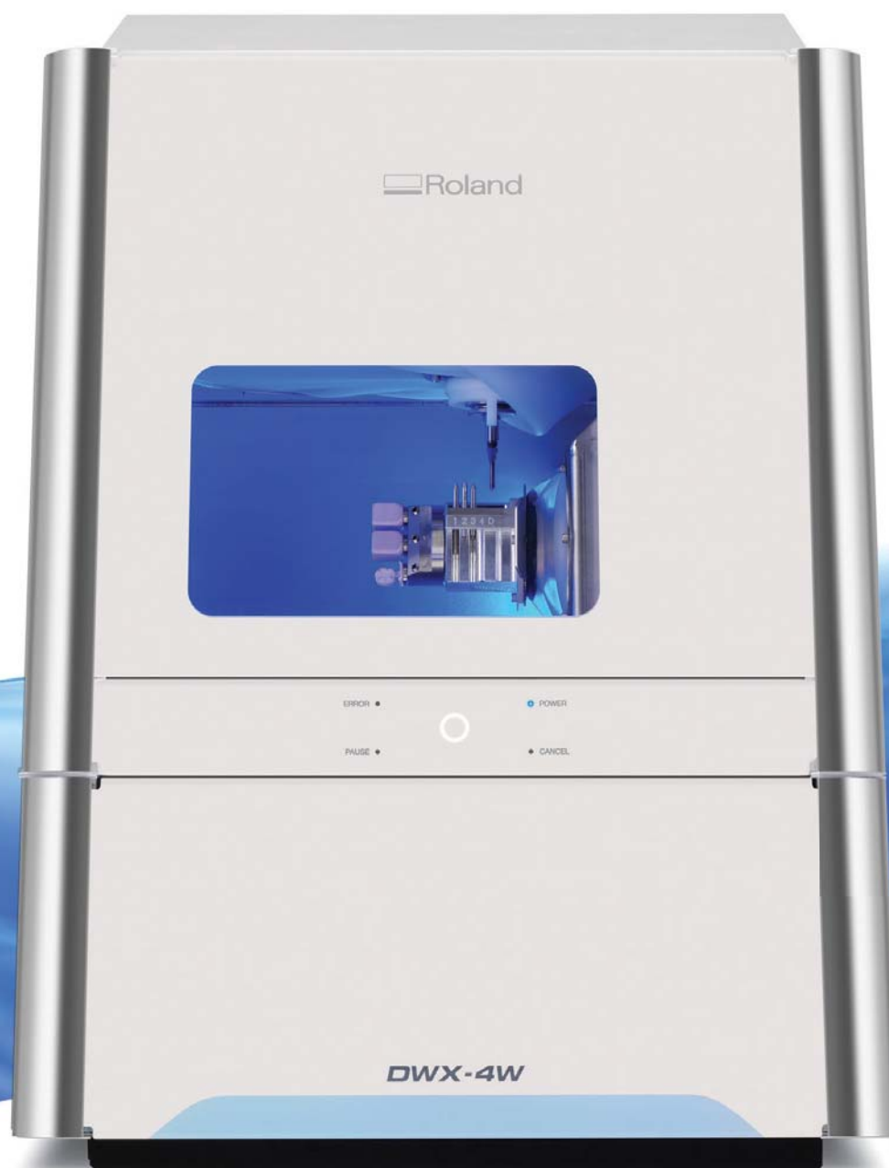
THE NEW DWX-4W Wet Dental Mill