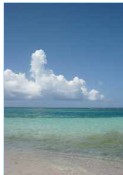
Puerto Rico will be the site of the NESO/MASO joint meeting this November.

For more general program information, visit www.maso.org/meetings/2013AS.cfm .