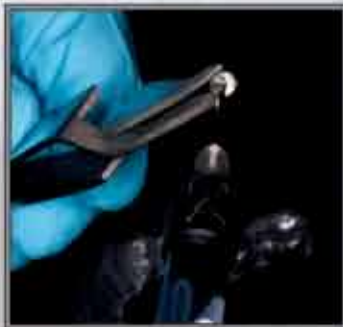
Place Bond Aligner™ on attachment