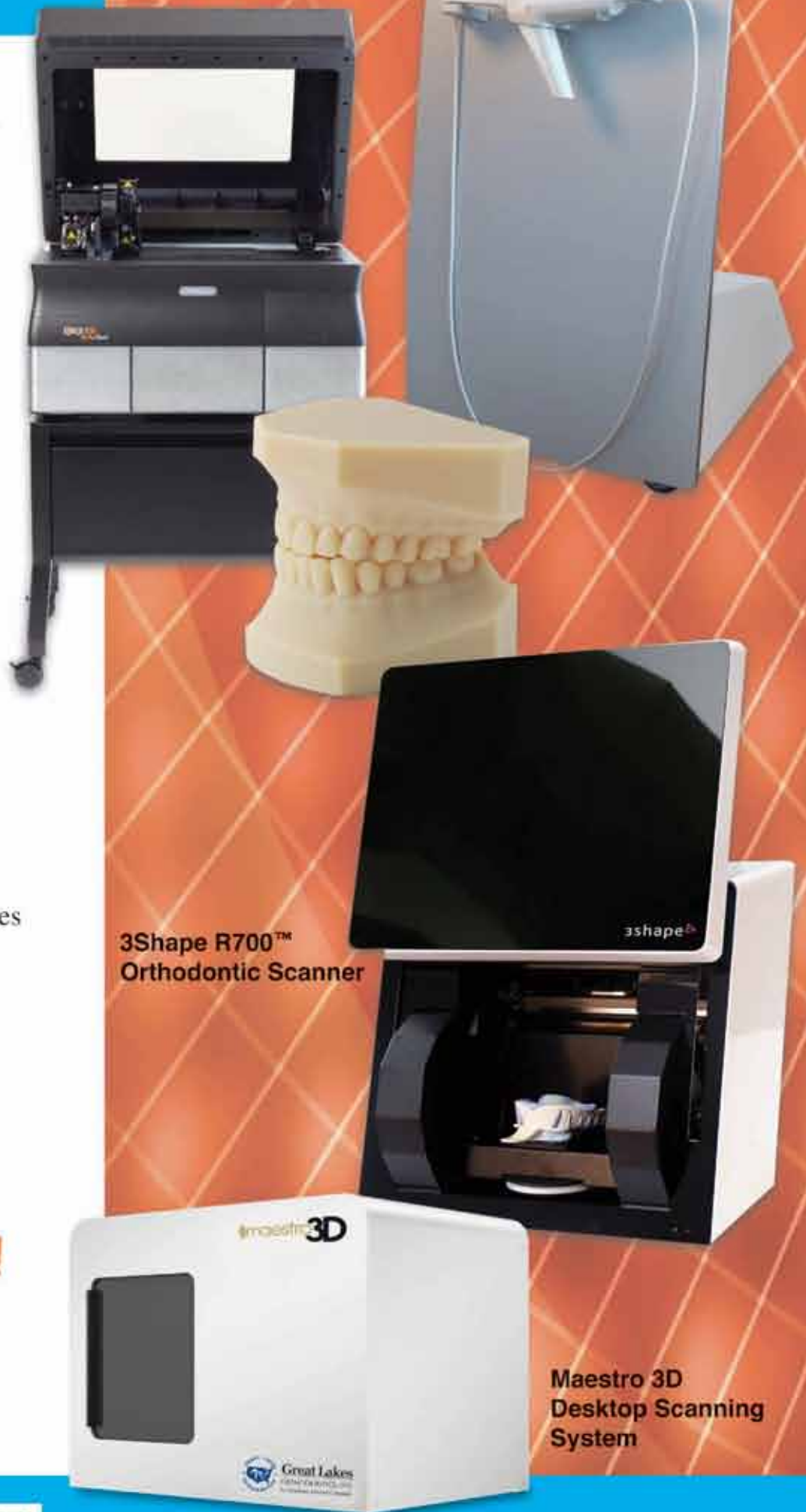
Maestro 3D Desktop Scanning System