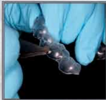
Place attachment on aligner