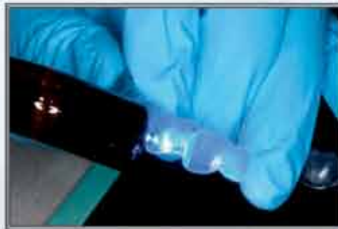
Cure the Bond Aligner™