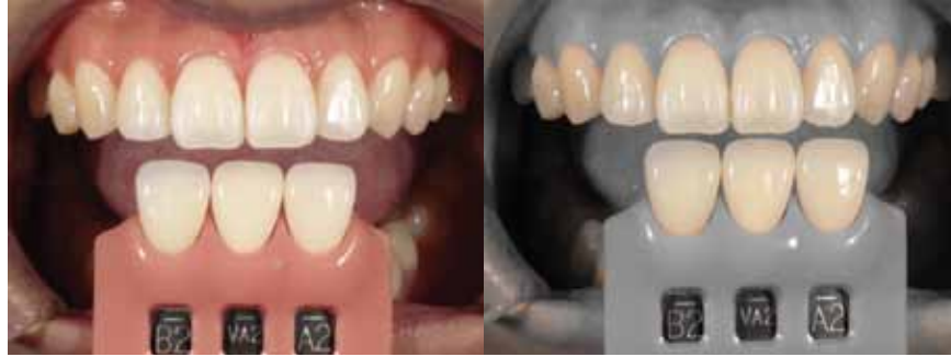
• Shofu's EyeSpecial C-II digital dental camera includes the isolate shade mode, which grays out the gingival tissue for optimal shade matching.

Like smart phones and tablets, the EyeSpecial C-II is designed to be highly intuitive and user friendly. It has eight pre-set dental shooting modes for efficient dental photography and features numerous smart functions that can enrich peer-to-peer and lab collaboration and patient