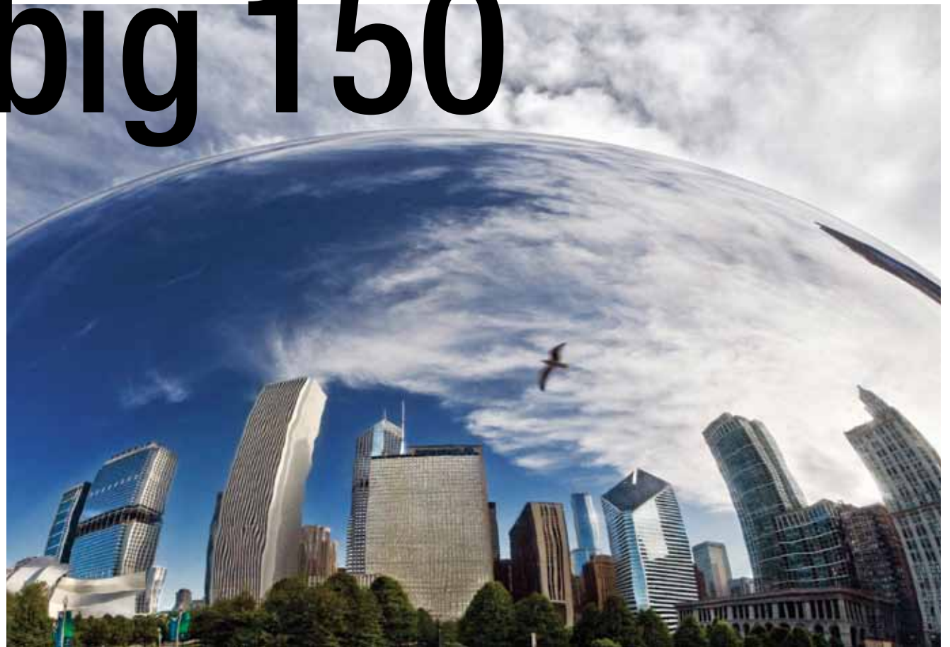
Cloud Gate at Millennium Park.