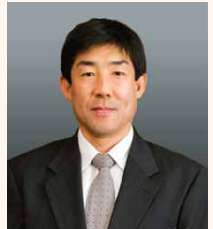
NSK President and COO Eiichi Nakanishi

Other certifications NSK has earned include: EN 46001 (stricter guarantee of quality for medical apparatus in Europe); ISO 13485 (another international standard); MDD (93/42/EEC) (European accreditation); and ISO 9001 (the international standard of a guarantee of quality).