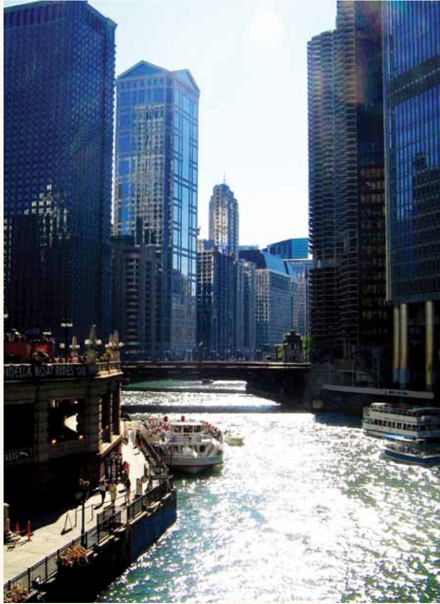
A view of Chicago.