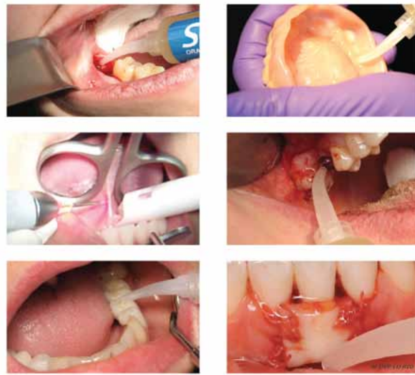
Use SockIt! with various procedures, including extractions, immediate dentures, laser procedures, implants, hygiene procedures, grafts and more.

SockIt! signals a revolution in oral wound care because of the benefits it provides and the safety it possesses.