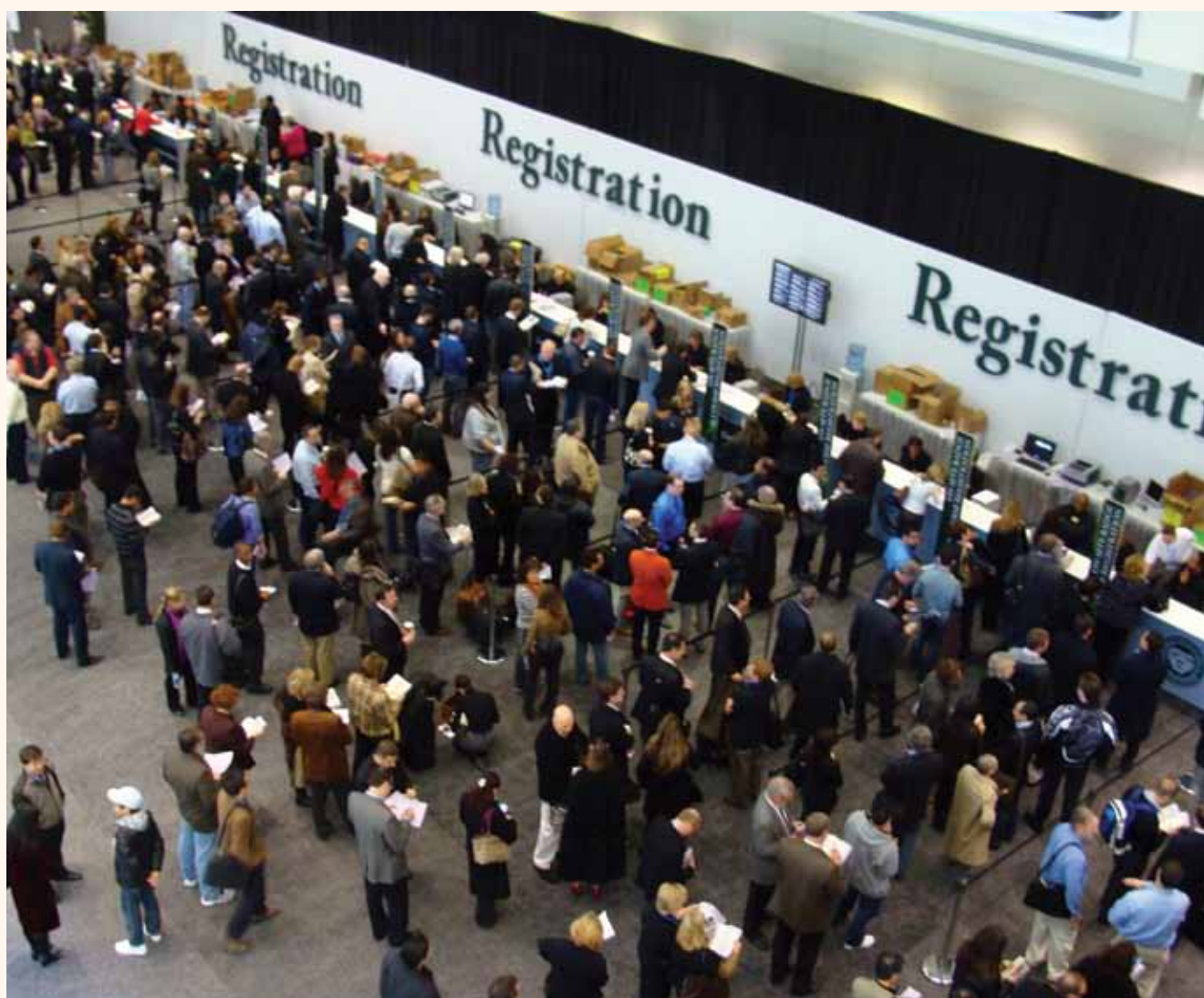
Attendees wait to register for the 45th annual Chicago Dental Society's Midwinter Meeting.