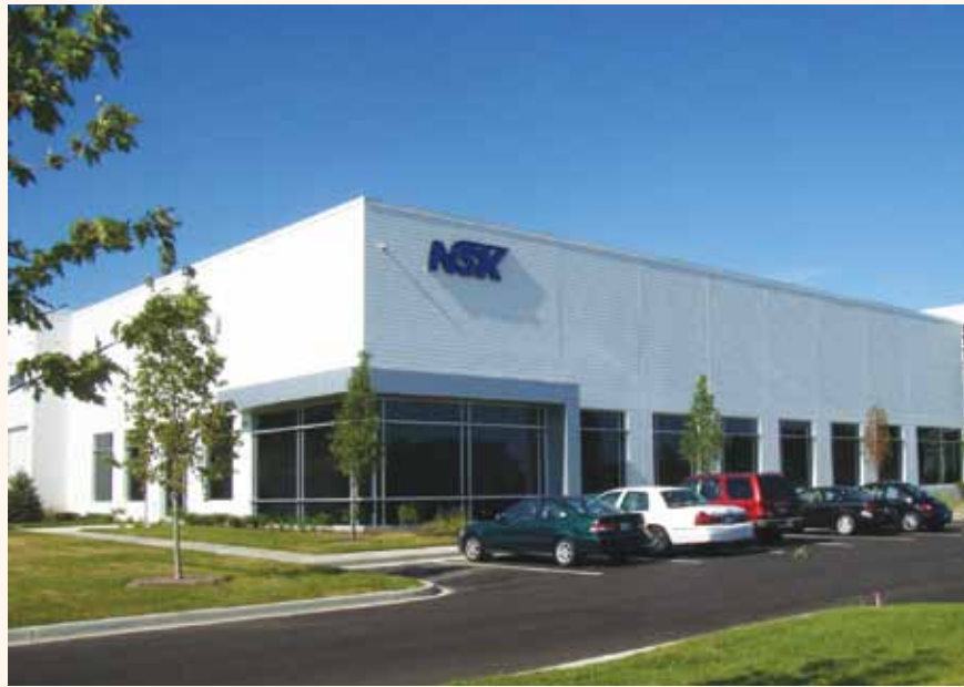
U.S. headquarters in Hoffman Estates, Ill.

Control of all aspects of the development process helps NSK ensure timely regulatory compliance, improve reliability and