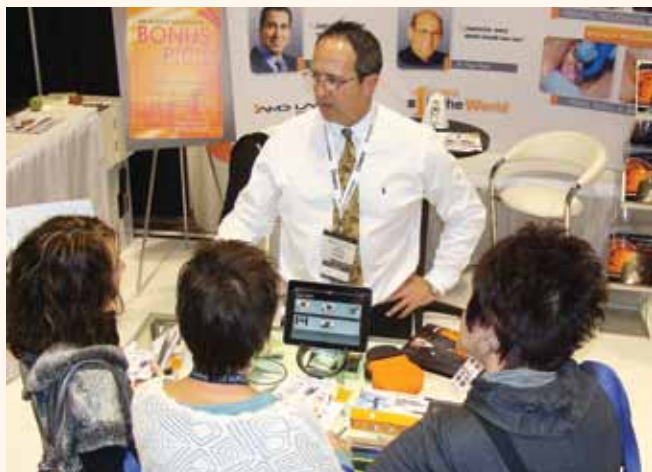
Meeting attendees stop by AMD LASERS (booth No. 1434) to get more information on affordable laser technology.