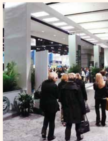
Plenty of new products await these Midwinter Meeting attendees as they make their way to the exhibit hall.

Finally, Bosworth Co. is celebrating 100 years in business. You can stop by the booth (No. 3411) and pick up a cake pop to help the company celebrate. Yum!