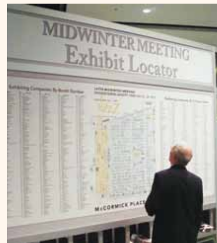
If you're not exactly sure where to go, you can look it up on the map of the show floor.