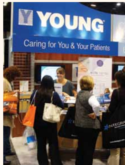
Meeting attendees visit the booth of Young Dental Mfg. Co. (No. 3822).