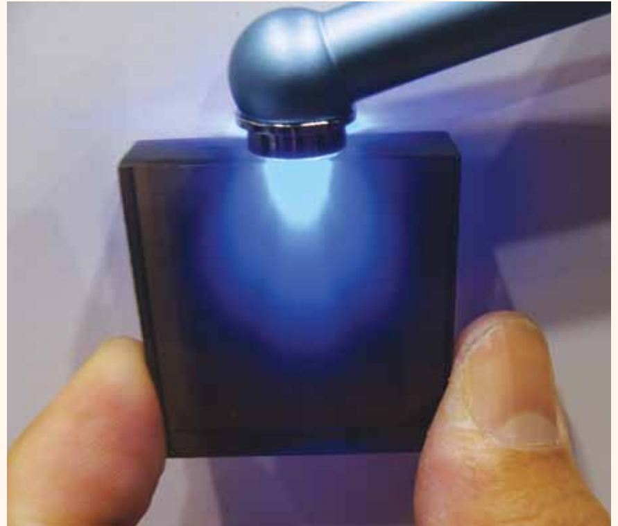
The focused beam generated by the FUSION curing light offers multiple applications.

And for eye protection, a Laser Filter converts a regular magnifying loupe into a laser loupe.