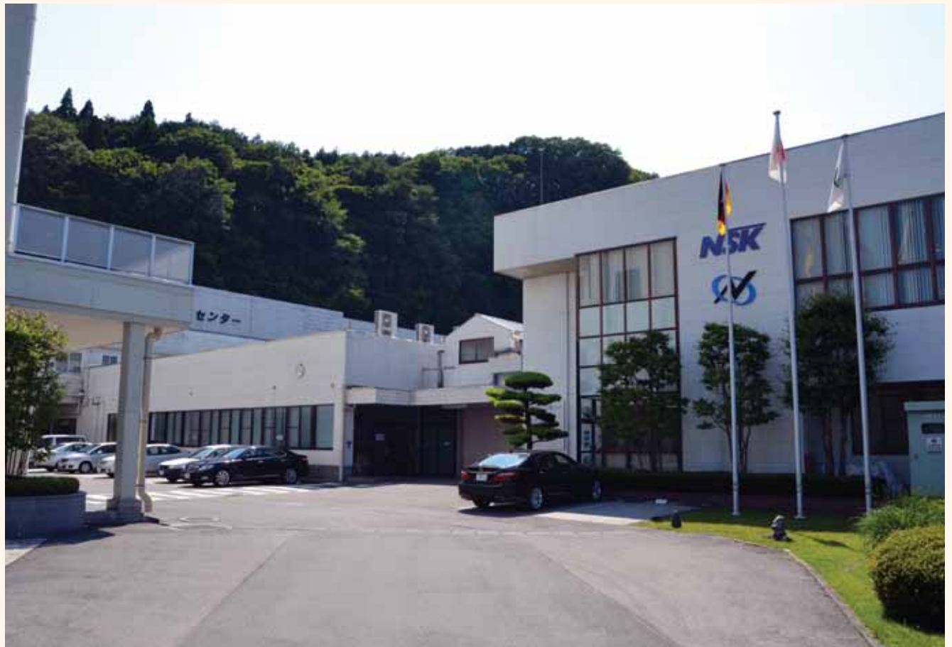
The company's headquarters in Tochigi, Japan.