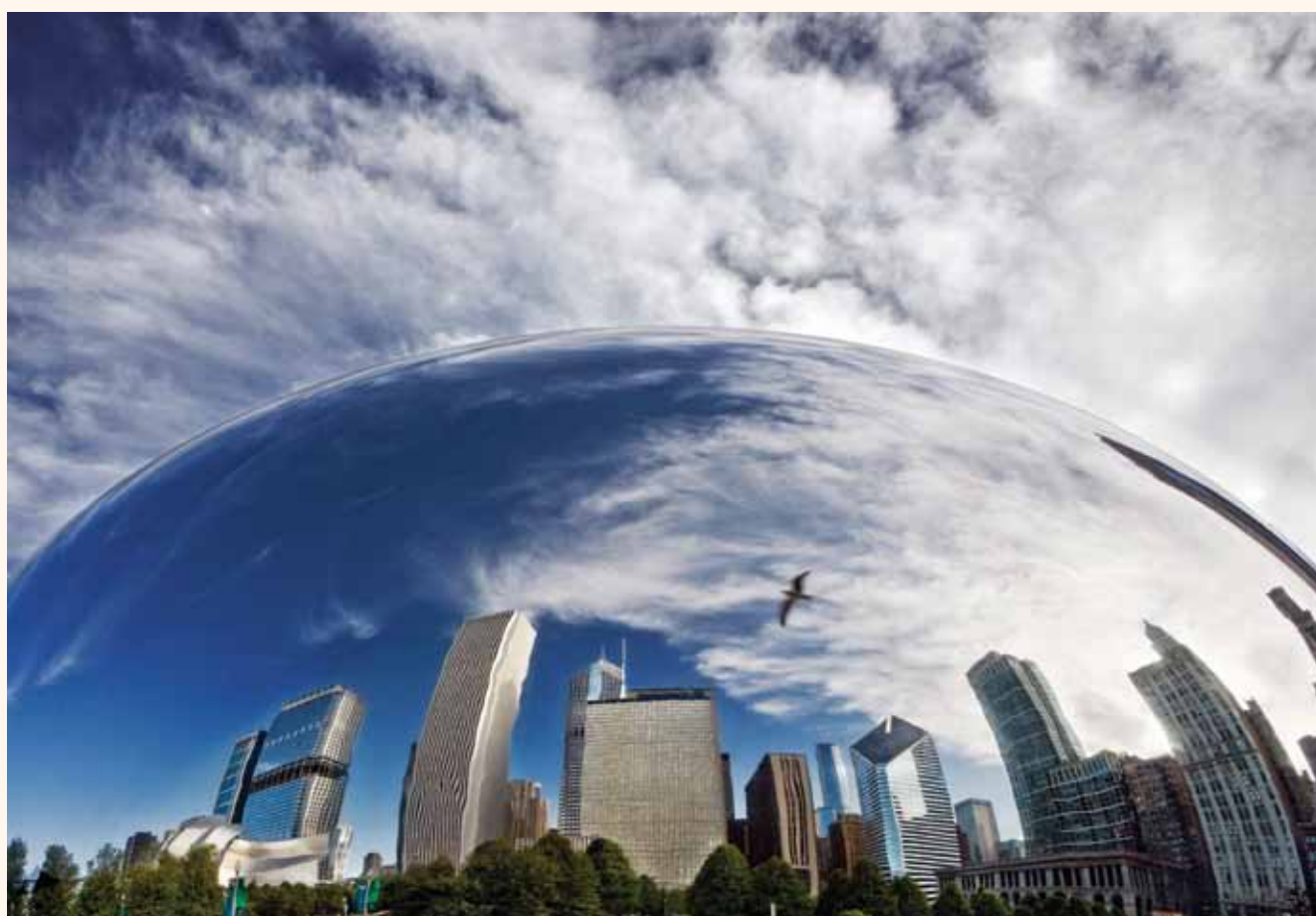
Cloud Gate at Millennium Park2.

Make an escape from the cold by checking out the countless array of scientific sessions, exhibitors and social events that await you here at McCormick Place West