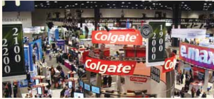
The exhibit hall at the 2012 Chicago Midwinter.

Social events for the next few days include the Blue Man Group (at the Briar Street Theater following the welcome re-