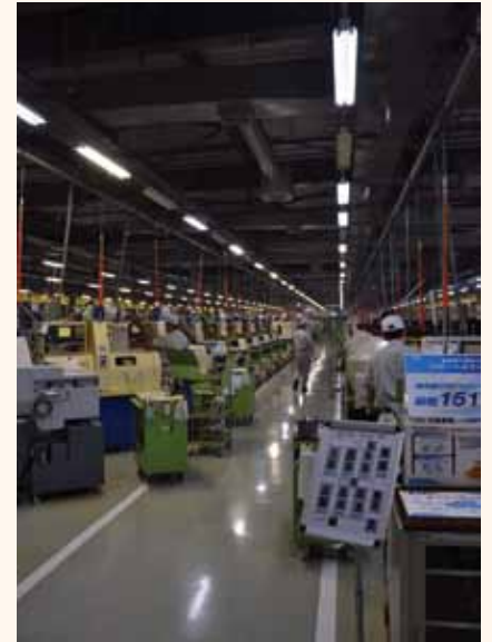
NSK still manufactures most of the precision parts in-house.