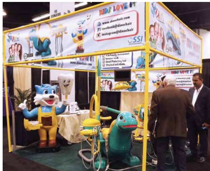
• Looking to brighten up your dental practice? Ossi Corp's Dino Dental Chair will have young clients flocking to your office. Check them out at booth No. 381.