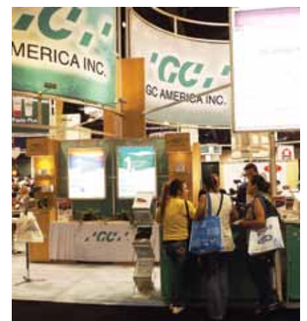
• GC America booth, No. 726, attracts attendees Thursday morning.