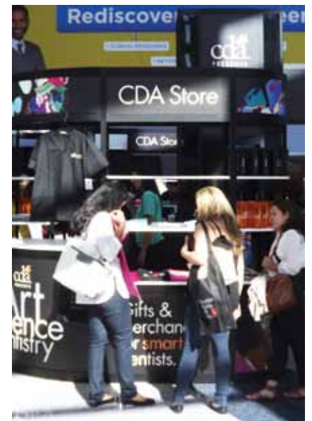
• Want to go home with some souvenirs of your trip to Southern California? Stop by the CDA Store in front of the exhibit hall for some CDA swag.