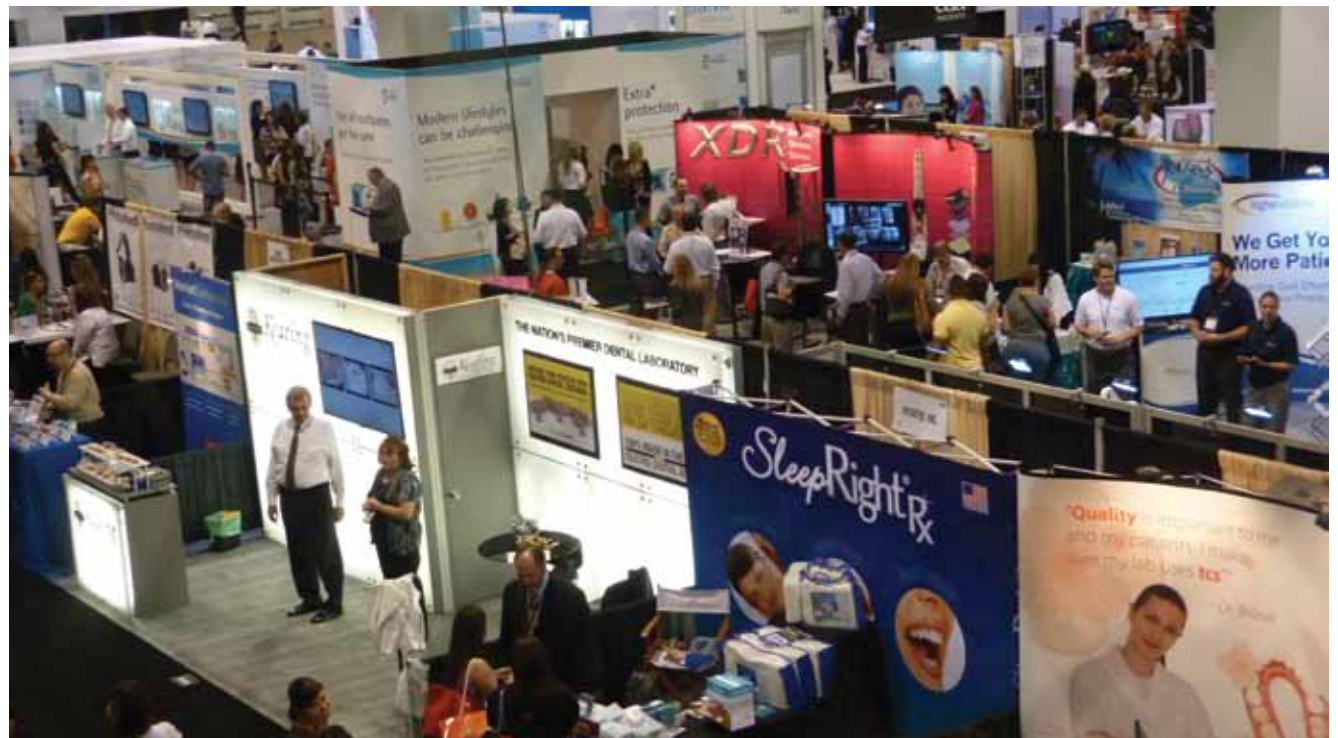
»see LAUNCH, page 3