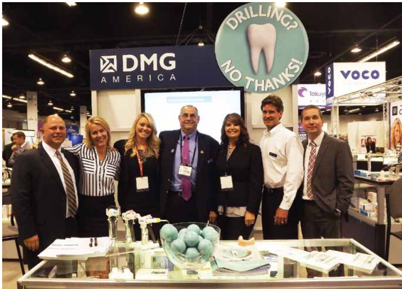
• The cheerful crew at DMG stand ready to help attendees at booth No. 446.