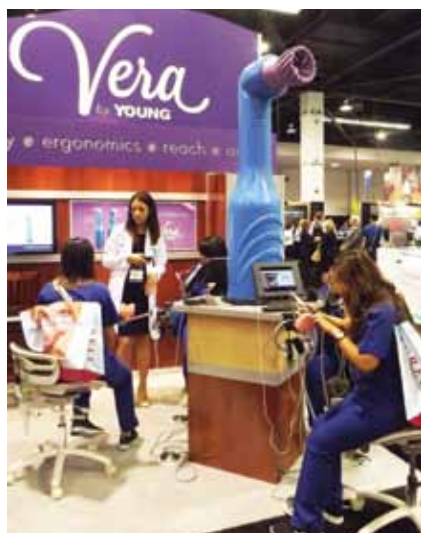
• Dental students try out the products at the Young Dental booth, No. 1430.