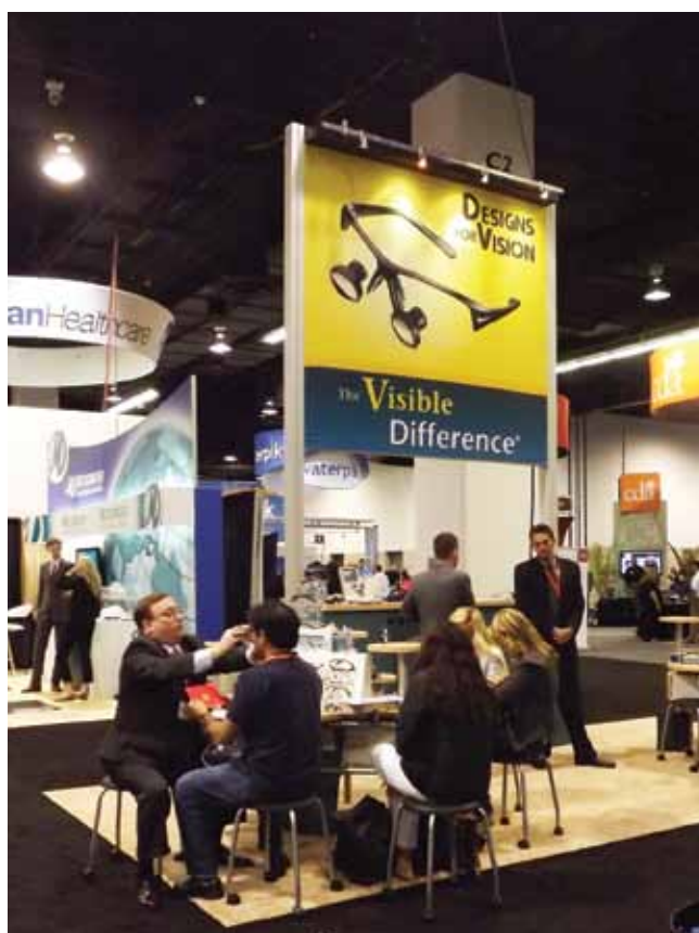
• CDA attendees try out 'the visible difference' at the Designs for Visions booth, No. 1204.