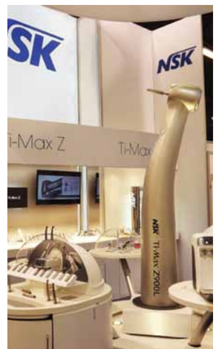
• Catch a glimpse of the giant Ti-Max 2900L at the NSK booth, No. 460.