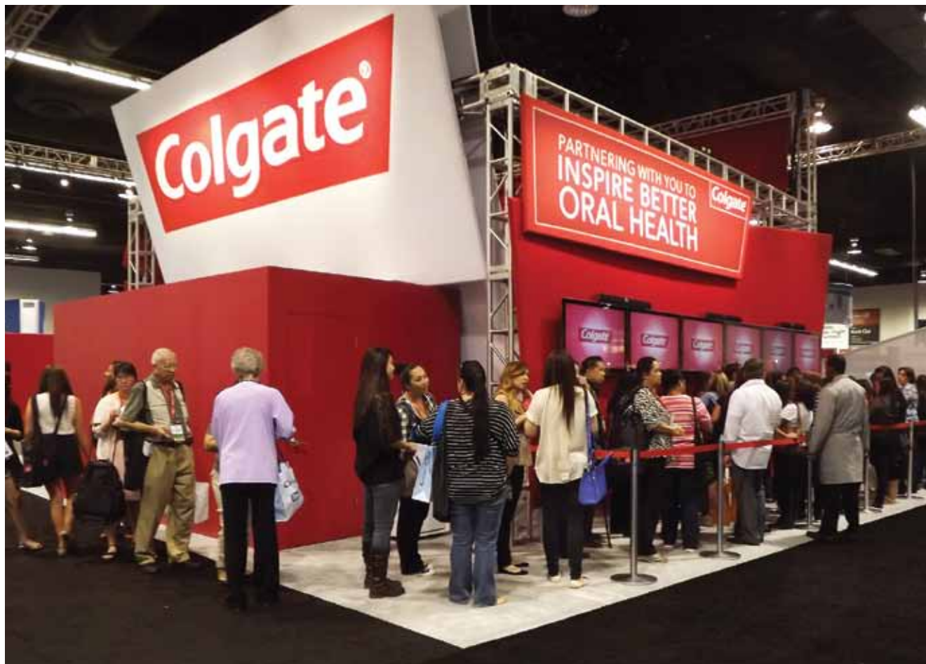
• CDA attendees form a line to check out all the latest from Colgate at booth No. 1316.