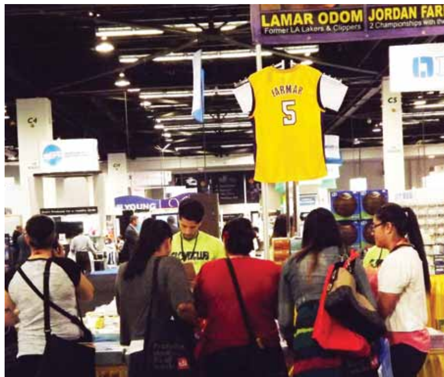
• Attendees stop by the Glove Club booth, No. 832. Sports fans will want to come back by the booth today and Saturday when former L.A. Lakers and Clippers' player Lamar Odom and L.A. Lakers' Jordan Farmar will be on hand to sign memorabilia.