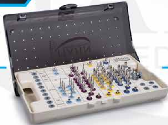
Hahn™ Tapered Implant Guided Surgical Kit

Purchase 25 implants for $4,000 and receive