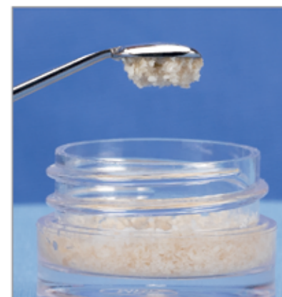
Exceptional Handling Characteristics

White Paper Available At: www.salvin.com/Downloads/Guides-Studies.html