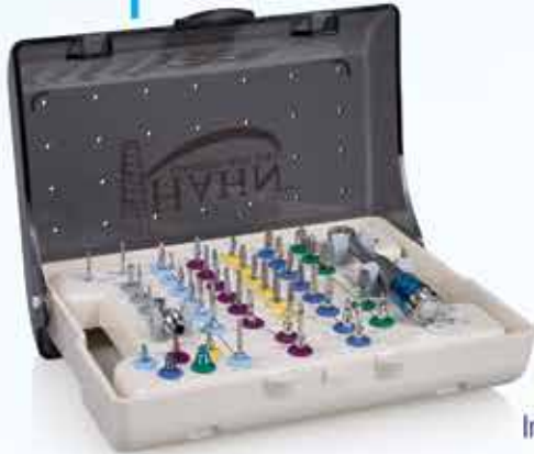
Hahn™ Tapered Implant Surgical Kit