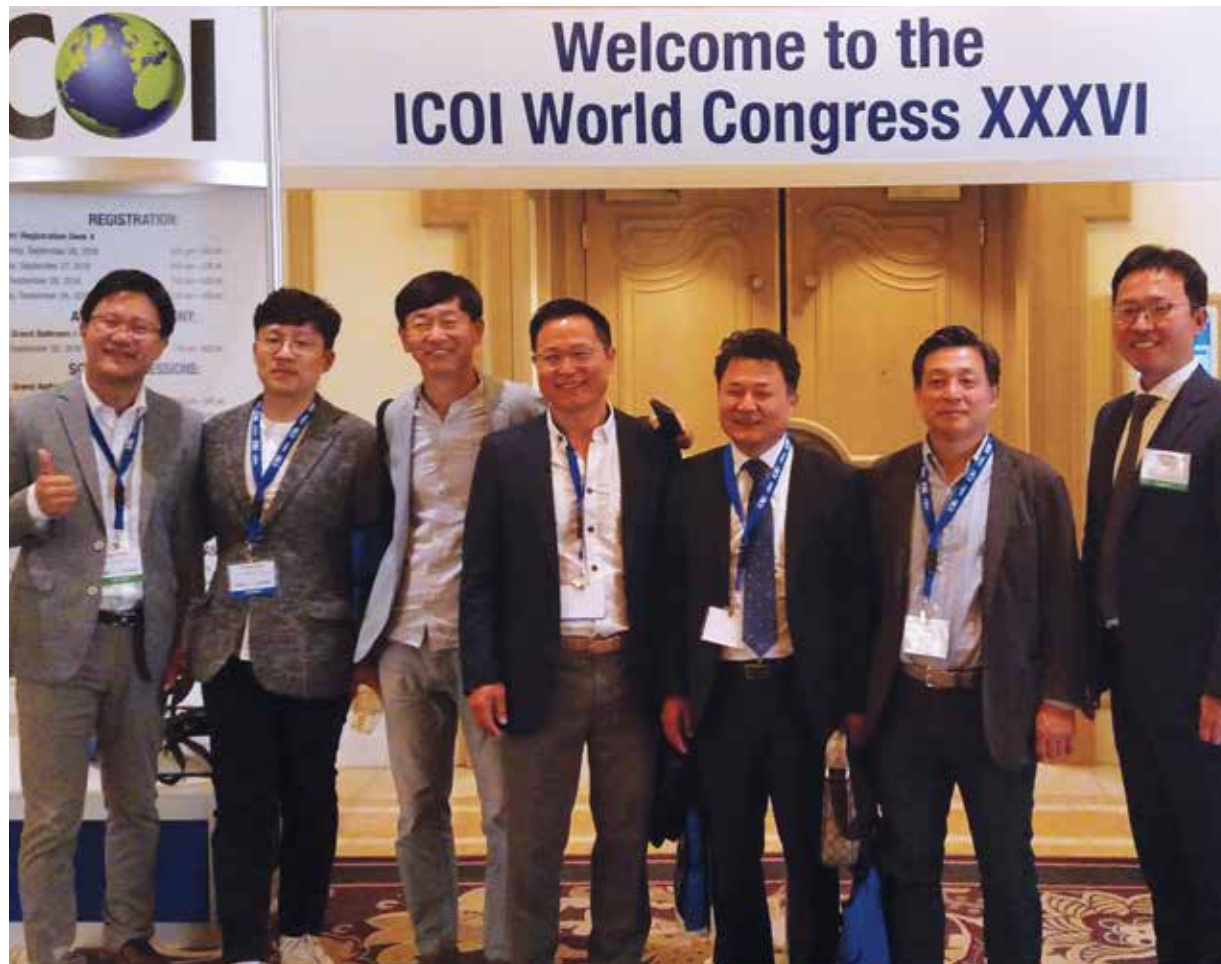
• ICOI World Congress attendees can take part in a variety of educational sessions, featuring world-class speakers.