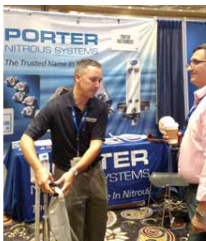
• Learn about new nitrous oxide delivery options at the Porter Instrument booth, No. 404.