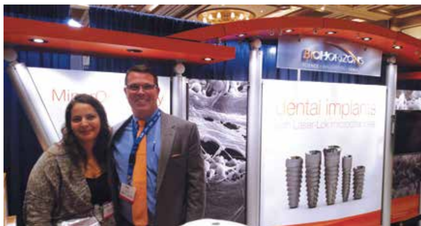
• Pop by BioHorizons at booth Nos. 307/309 to see the company's newest products and technology.

• To check out the Dr. Choukroun Soft Brushing Kit and other products and show specials, visit Dental Implant Technologies at booth Nos. 503/505.