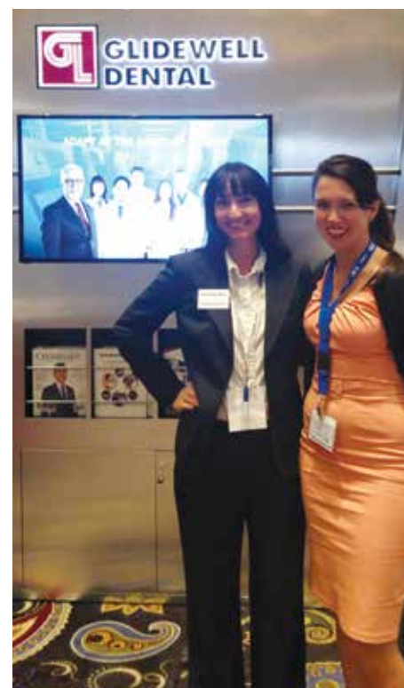
• Visit Glidewell Dental at booth Nos. 400/402 and inquire about show specials on the Hahn Tapered Implant System, available here in Las Vegas.