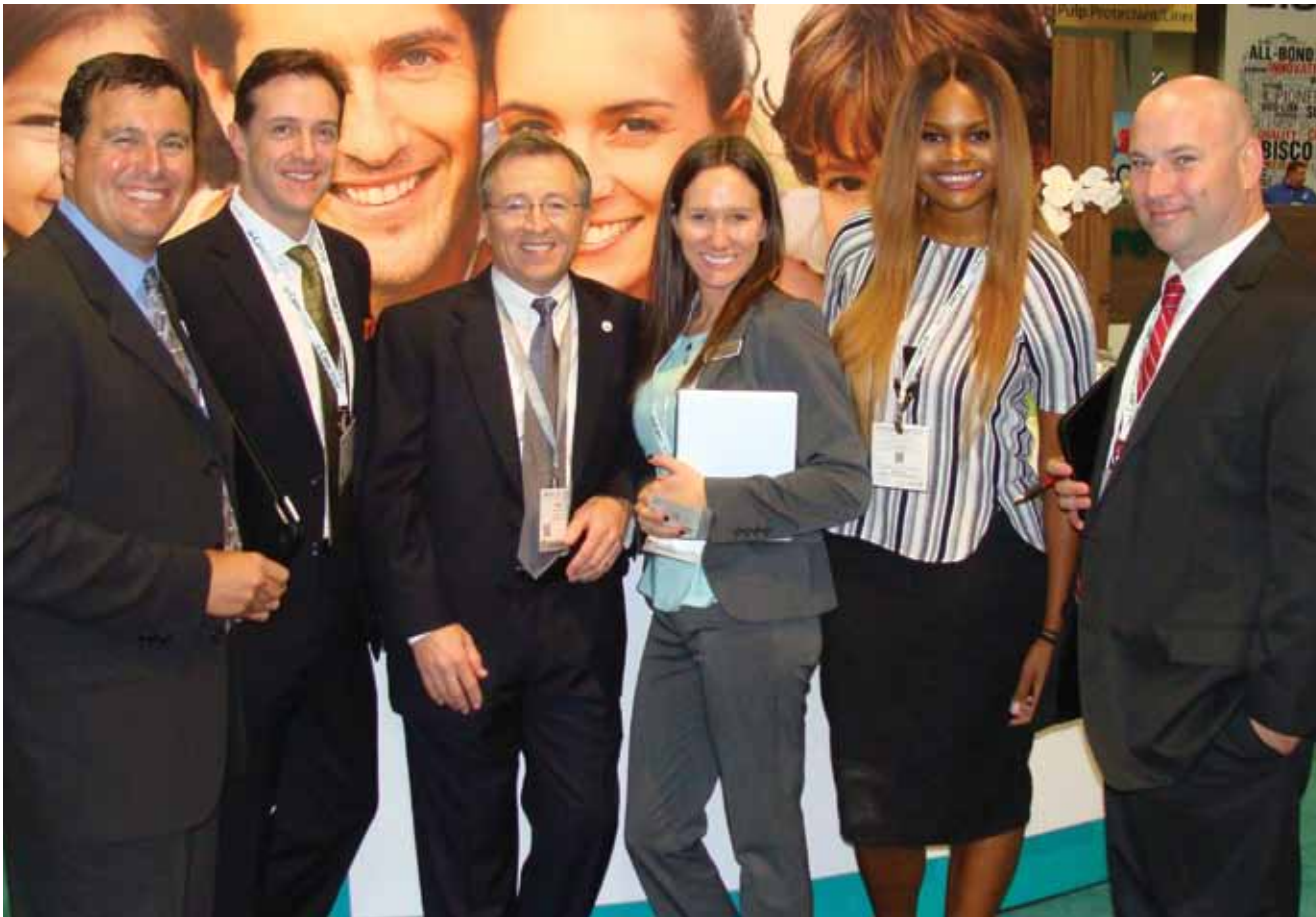
• They're all smiles at CareCredit (booth No. 1129).