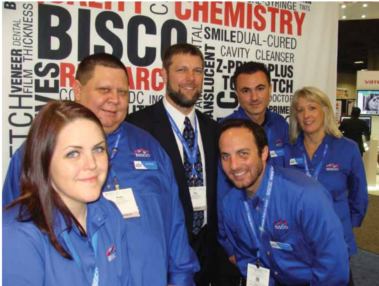
• The folks at Bisco Dental Products are at your service (booth No. 1037).