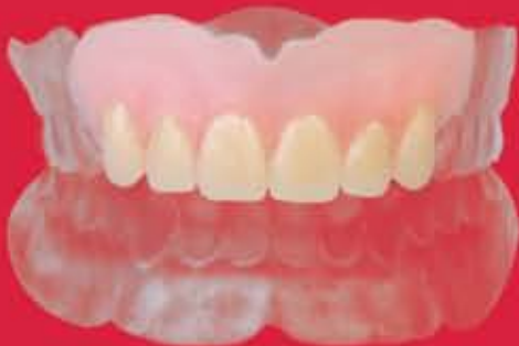
CAD/CAM-Printed Denture Setup

"I just received back my first Simply Natural Digital Dentures case. The patient loves the fit especially; it even improved her ability to speak."