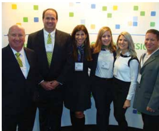
• The team at Benco Dental Co. (booth No. 923).