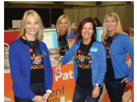
• The marketing geniuses at PracticeGenius/Patient Rewards Hub (booth No. 1655) have plenty of tools for dental practices.