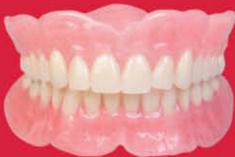
Final Simply Natural Digital Dentures