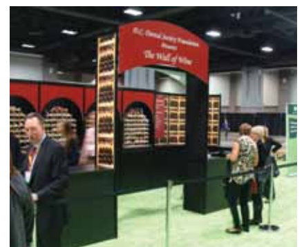
• The D.C. Dental Society Foundation presents the Wall of Wine on the exhibit hall floor.