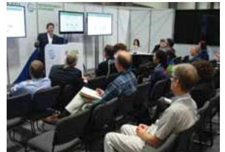
• Meeting attendees learn about interoperability standards during an educational presentation on the exhibit hall floor.