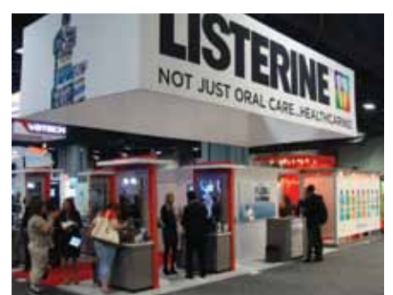
• Johnson & Johnson Consumer (booth No. 737).