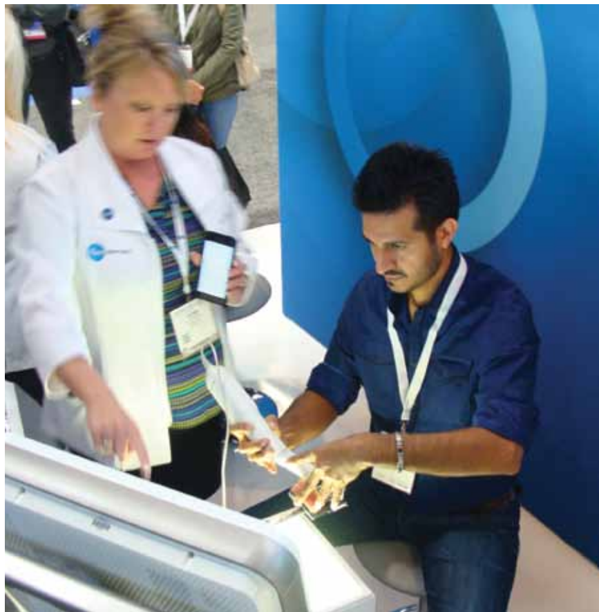
• A meeting attendee gets hands-on experience with scanning equipment at iTero (booth No. 1001).