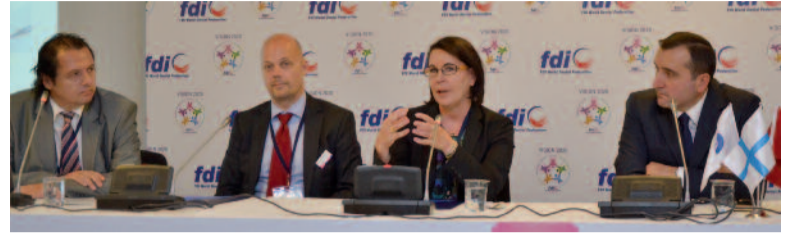
■ Representatives from both companies also talked about the new partnership at a press conference held yesterday in the Istanbul Congress Center.

Plandent's mission is to offer the latest technology and materials from