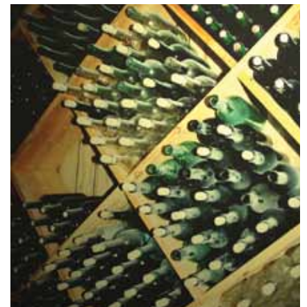
• Donate $20 and get a chance to pull a bottle of wine from the ‘wine wall.’