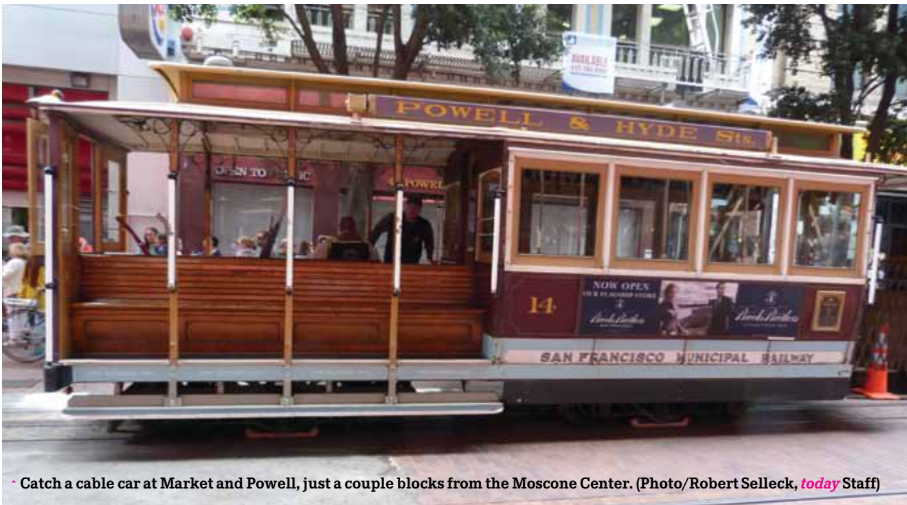
• Catch a cable car at Market and Powell, just a couple blocks from the Moscone Center.