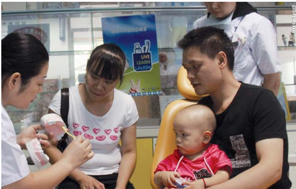
Dental assistants demonstrating effective oral hygiene measures on a model to a Chinese mother.

LLL partnership targets mothers with young children