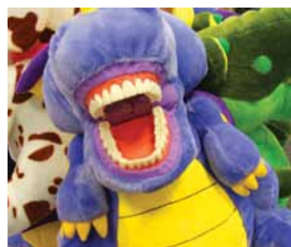
• Young patients will love the treats you pick up at Sherman Specialty's booth, No. 3826.