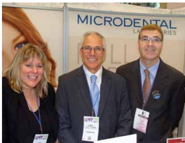
• Ask the team at MicroDental Laboratories, booth No. 4804, about its restorations and dental devices.