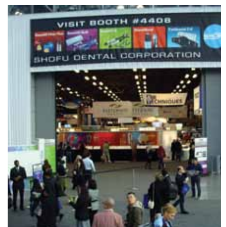
• Attendees stream into the exhibit hall Monday morning.