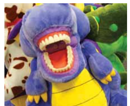
• Young patients will love the treats you pick up at Sherman Specialty's booth, No. 3826.