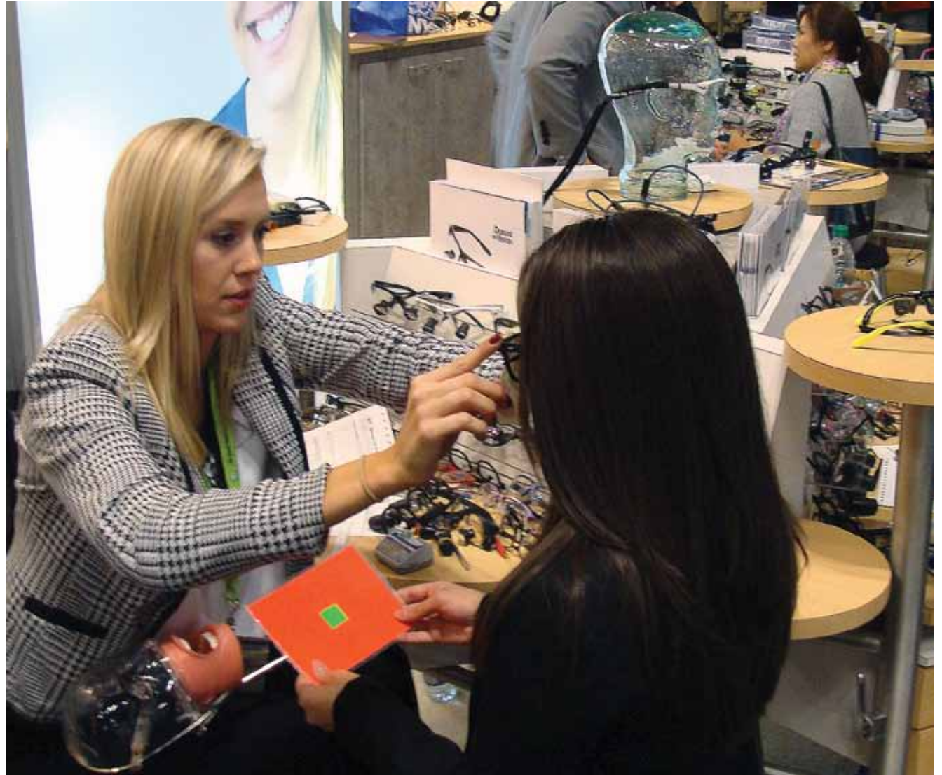
• A meeting attendee tries on some loupes at Designs for Vision (booth Nos. 2012/1813).