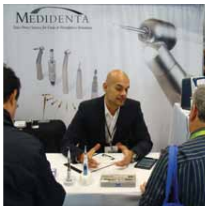
• Meeting attendees visit Medidenta (booth No. 916) to learn more about endodontic equipment and handpieces.