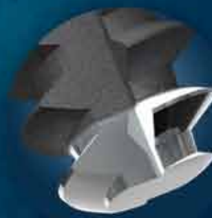
Bull Nose Auger™ tip

Visit OCO at the 2016 GNYDM Booth # 4135