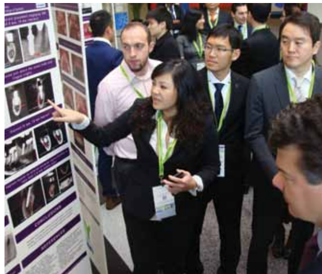
• Meeting attendees gather around a presenter to learn more about implant dentistry Sunday morning during the Scientific Poster Session offered by residents and post-graduate dentists.