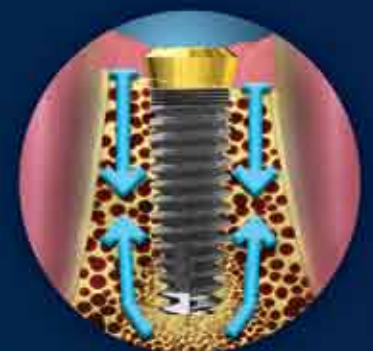
Embedded Tapered Platform™ works in conjunction with the Bull Nose Auger™ tip providing Dual Stabilization™ for immediate or selective loading

[ THE NEXT GENERATION OF DENTAL IMPLANTS™ ]