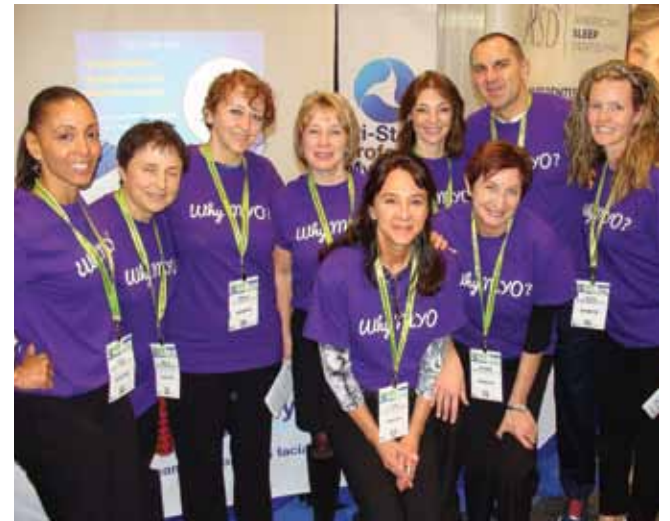
• The team at Tri-State Orofacial Myology (booth No. 5322).