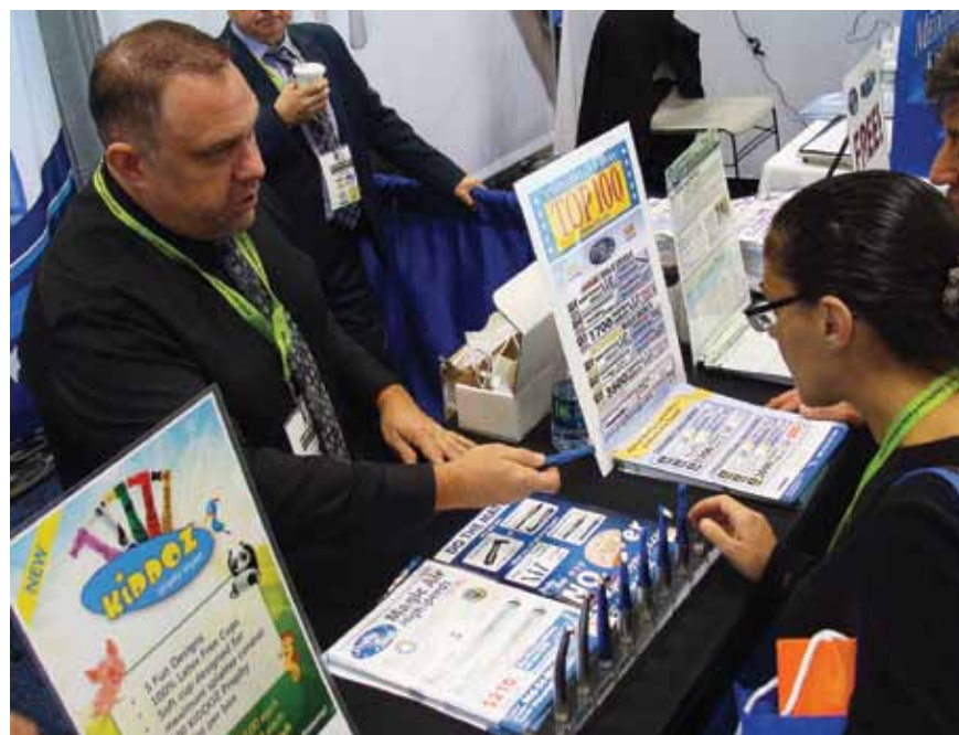
• An attendee stops by Propy Magic (booth No. 915) for product information.