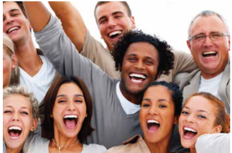
• These happy patients can be yours.

As patients have more and more choices for their dental care, don't lose a single patient because they fear coming to you. Give them the experience that keeps them coming back for years.