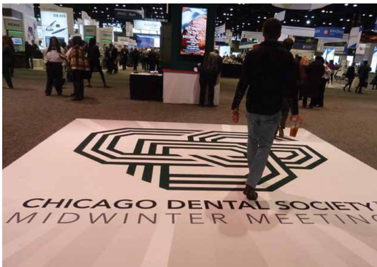
• Attendees enter the exhibit hall during the 2018 Chicago Midwinter Meeting.