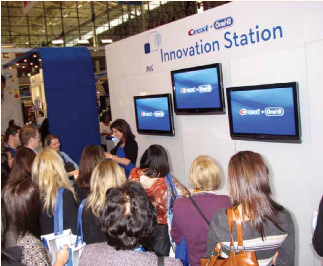
At the P&G booth (No. 1005), Crest Oral B offers oral solution kits for the six most common concerns patients bring to the dental practice. These kits help you and your practice Go Beyond 'Open Wide' .