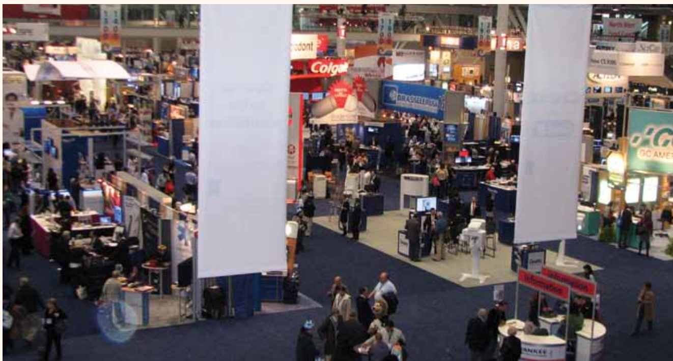
A bird's eye view of the exhibit hall on Thursday afternoon.