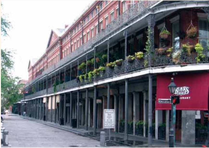
An LVI regional event will be held in New Orleans on March 9 and 10.