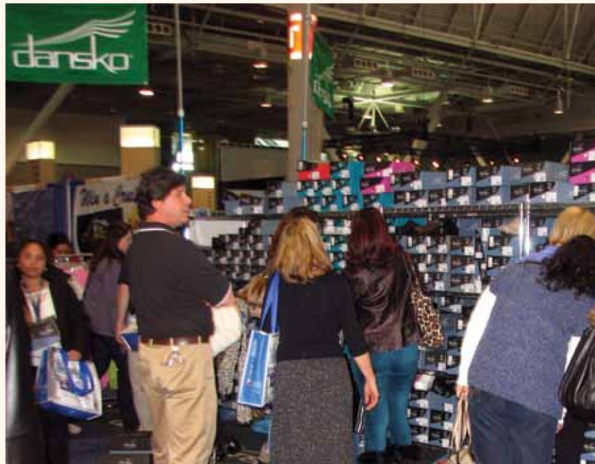
Comfy feet are happy feet, and if you need a pair of shoes, swing by the Dansko booth (No. 1248) to find a style that suits you.

The exhibit hall is open until 5:30 p.m. today and 4:30 p.m. on Saturday. Be sure to set aside extra time for a leisurely stroll through the aisles to find the new products and companies you may not yet be aware of; you'll be glad you did.