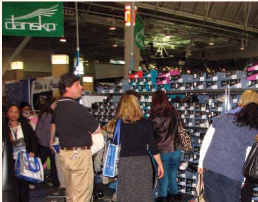
Comfy feet are happy feet, and if you need a pair of shoes, swing by the Dansko booth (No. 1248) to find a style that suits you.

The exhibit hall is open until 5:30 p.m. today and 4:30 p.m. on Saturday. Be sure to set aside extra time for a leisurely stroll through the aisles to find the new products and companies you may not yet be aware of; you'll be glad you did.