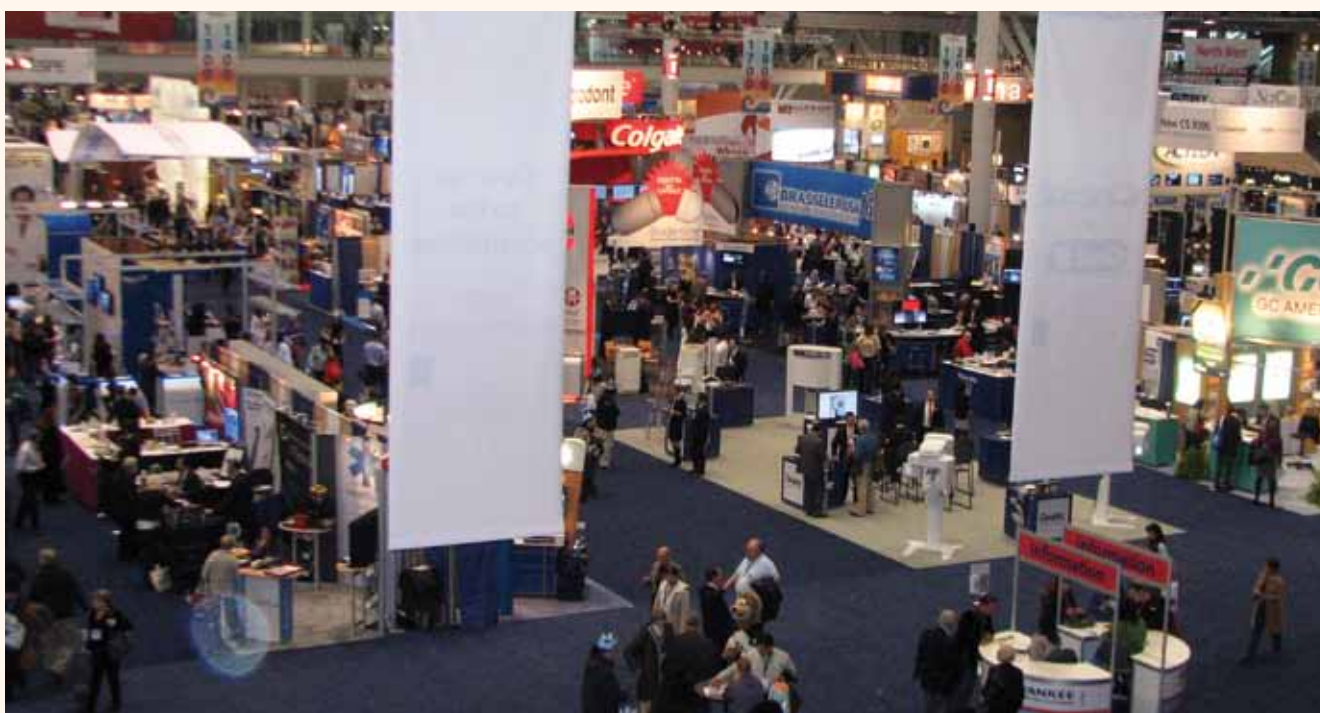
A bird's eye view of the exhibit hall on Thursday afternoon.