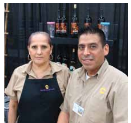
• You can get wine and cheese at this station on the exhibit hall floor.