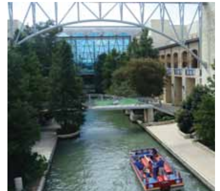
• Just outside the ADA 2014 here in San Antonio, the weather's great — perfect for a visit to the River Walk.