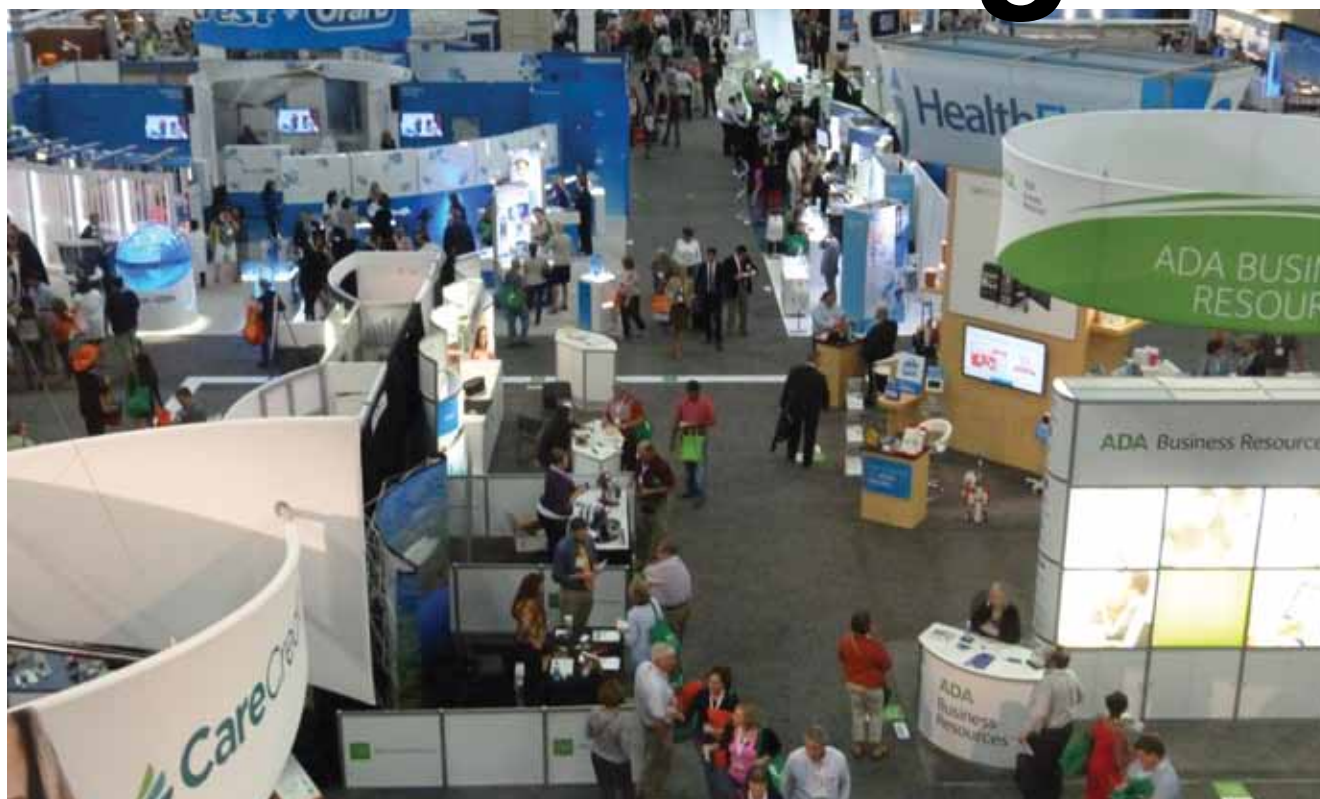
• Aisles bustle on Friday at the ADA 2014 World Marketplace Exhibition.