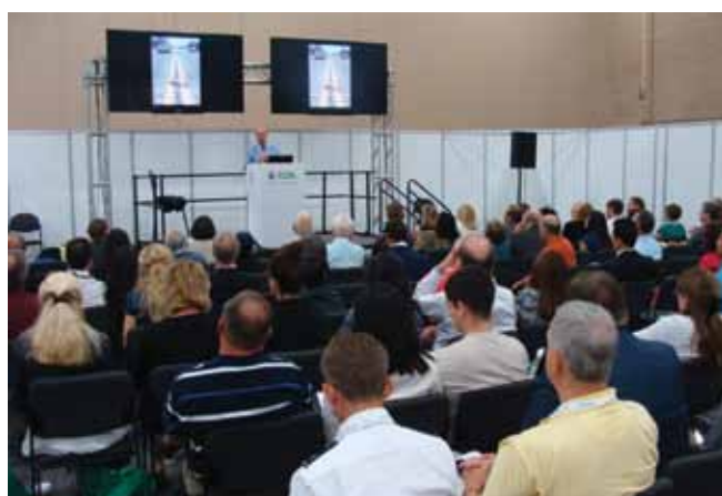
• There's plenty to learn right on the exhibit hall floor here at ADA.