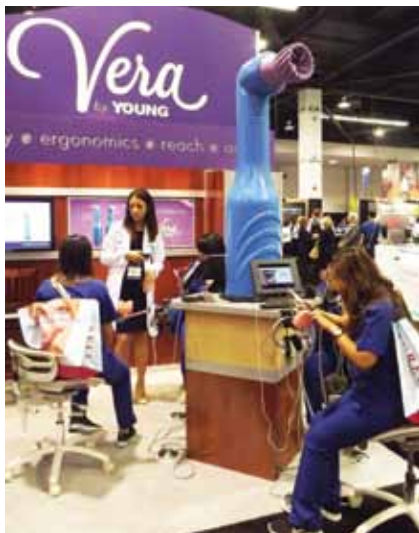
• Dental students try out the products at the Young Dental booth, No. 1430.