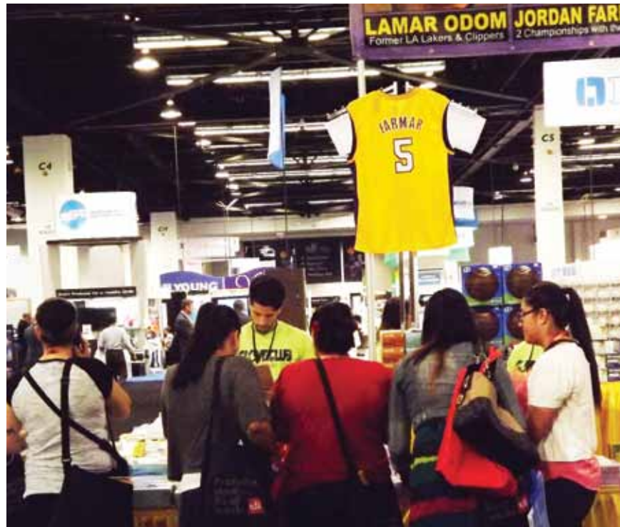
• Attendees stop by the Glove Club booth, No. 832. Sports fans will want to come back by the booth today and Saturday when former L.A. Lakers and Clippers' player Lamar Odom and L.A. Lakers' Jordan Farmar will be on hand to sign memorabilia.