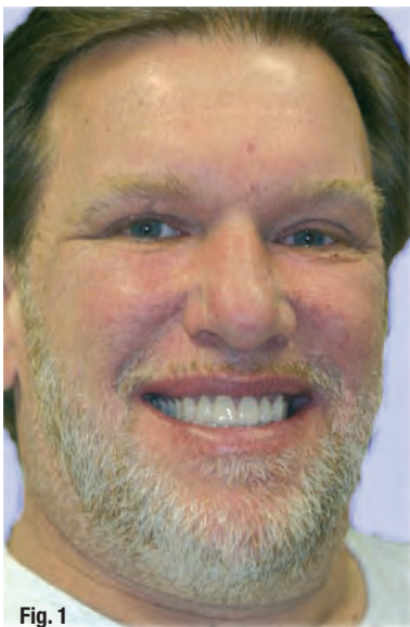
Fig. 1_After, full face.

In addition, with the materials available to you today, this can be a relatively easy treatment. A lot of what we know about cosmetic dentistry came from prosthodontics. Full denture treatment used to be the ultimate in cosmetic dentistry before periodontal care changed the way dentists practice.