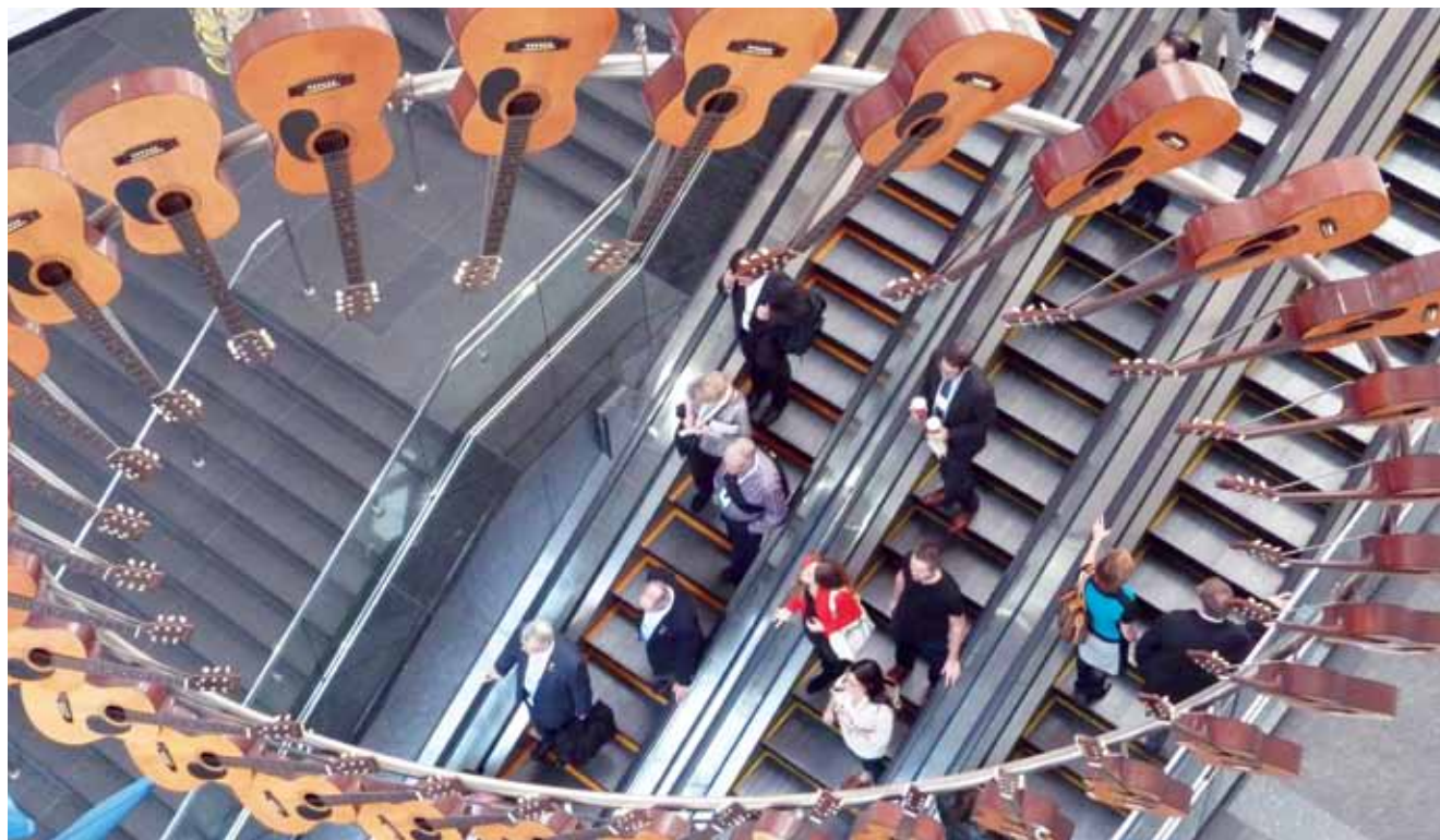
• ADA 2015 attendees pass beneath a section of the 'Five Easy Pieces' installment by Chicago artist Donald Lipski on their way to and from the exhibit hall Friday afternoon. The artwork hangs in the South Rotunda of the Walter E. Washington Convention Center.