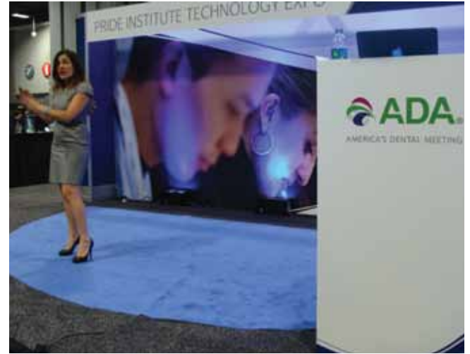
• A speaker offers an educational presentation in the Pride Institute Technology Expo on the exhibit hall floor.