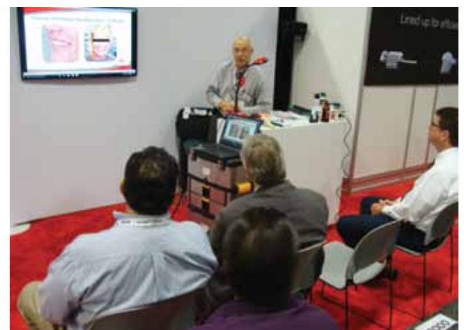
• A speaker offers an educational presentation to meeting attendees at Nobel Biocare (booth No. 3000).