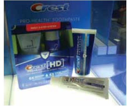
• Consumer products on display at Crest + Oral-B (booth No. 2501).