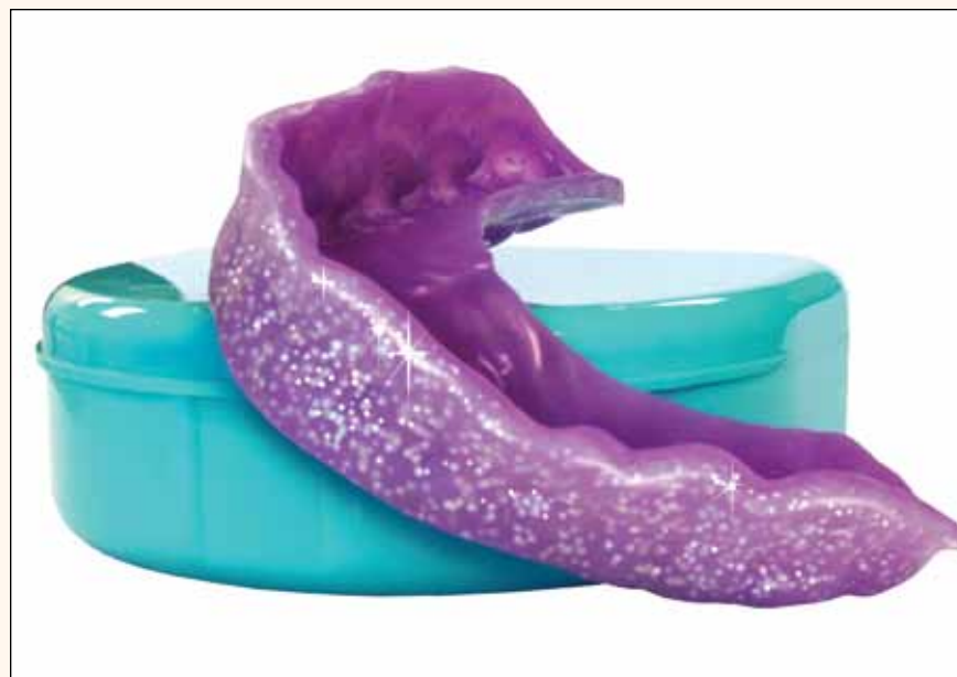
Keystone Industries Pro-form athletic mouth guard line gets a little more flash with Glitter Guards but still provides needed protection.

For more information on Pro-form's Glitter Guard or any Keystone product, contact Keystone Industries toll-free at (800) 333-3131, fax (856) 663-0381, go online to www.keystoneind.com or stop by the booth, No. 1848.