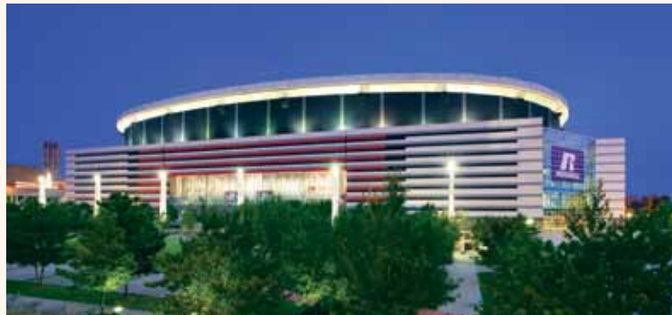
The Georgia Dome.

Piedmont Park is the largest green space in the city with festivals and events throughout the year. The park’s sidewalks are just some of many trails for use by pedestrians, bikers and rollerbladers. Other in-town trails include the South