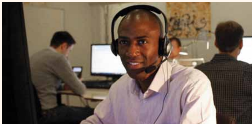
3Shape's support centers are placed strategically in the United States, Asia and several locations in Europe.

work, 3Shape's own support teams stand ready to assist distribution partners with any special hardware or software support issues. 3Shape's support centers are placed strategically in the United States, Asia and several locations in Europe.