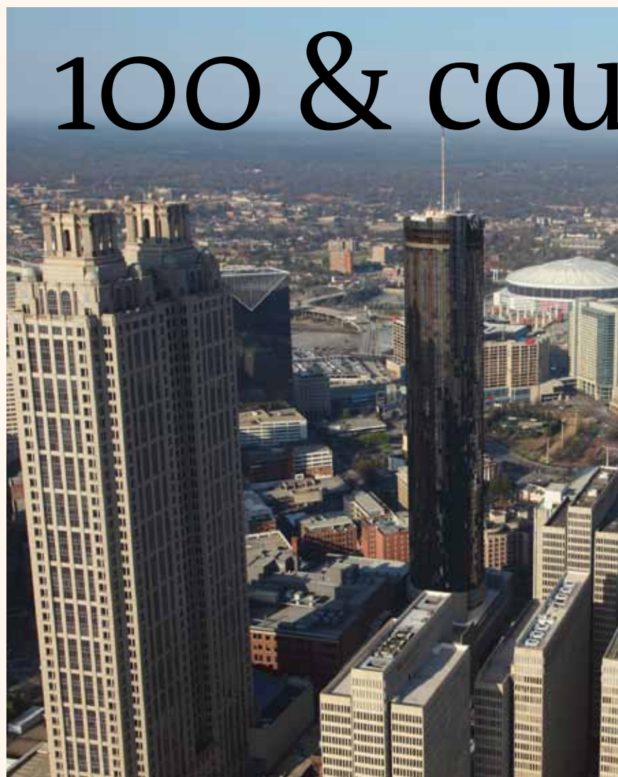
A view of Atlanta.