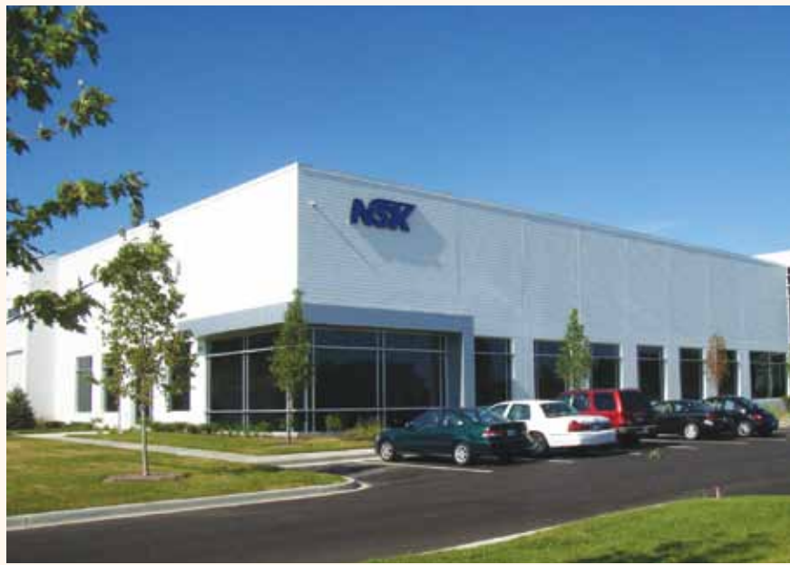
U.S. headquarters in Hoffman Estates, Ill.

Control of all aspects of the development process helps NSK ensure timely regulatory compliance, improve reliability and speed up development time. But even