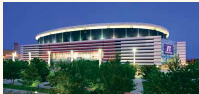
The Georgia Dome.

Piedmont Park is the largest green space in the city with festivals and events throughout the year. The park’s sidewalks are just some of many trails for use by pedestrians, bikers and rollerbladers. Other in-town trails include the South