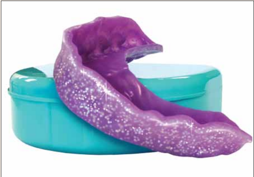
Keystone Industries Pro-form athletic mouth guard line gets a little more flash with Glitter Guards but still provides needed protection.

For more information on Pro-form's Glitter Guard or any Keystone product, contact Keystone Industries toll-free at (800) 333-3131, fax (856) 663-0381, go online to www.keystoneind.com or stop by the booth, No. 1848.