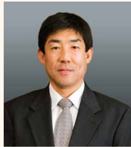
NSK President and COO Eiichi Nakanishi

Other certifications NSK has earned include: EN 46001 (stricter guarantee of quality for medical apparatus in Europe); ISO 13485 (another international standard); MDD (93/42/EEC) (European accreditation); and ISO 9001 (the international standard of a guarantee of quality).