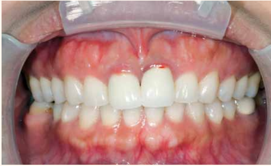
Fig. 1