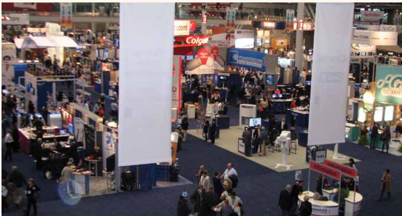
A bird's eye view of the exhibit hall on Thursday afternoon.