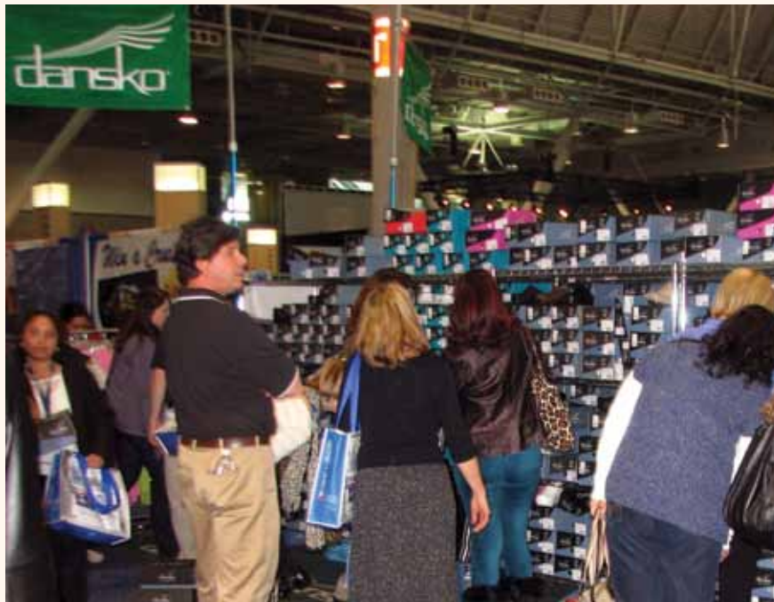
Comfy feet are happy feet, and if you need a pair of shoes, swing by the Dansko booth (No. 1248) to find a style that suits you.

The exhibit hall is open until 5:30 p.m. today and 4:30 p.m. on Saturday. Be sure to set aside extra time for a leisurely stroll through the aisles to find the new products and companies you may not yet be aware of; you'll be glad you did.