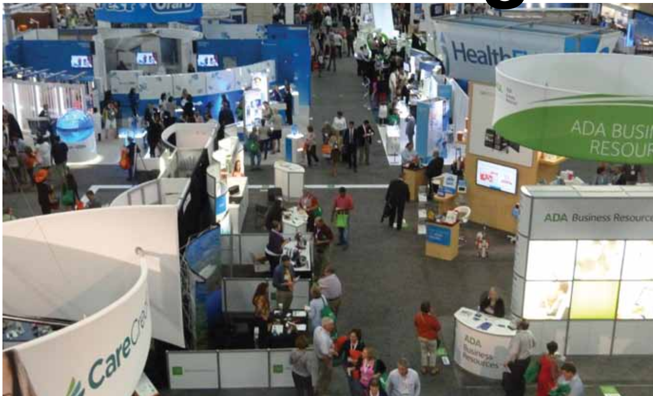
• Aisles bustle on Friday at the ADA 2014 World Marketplace Exhibition.