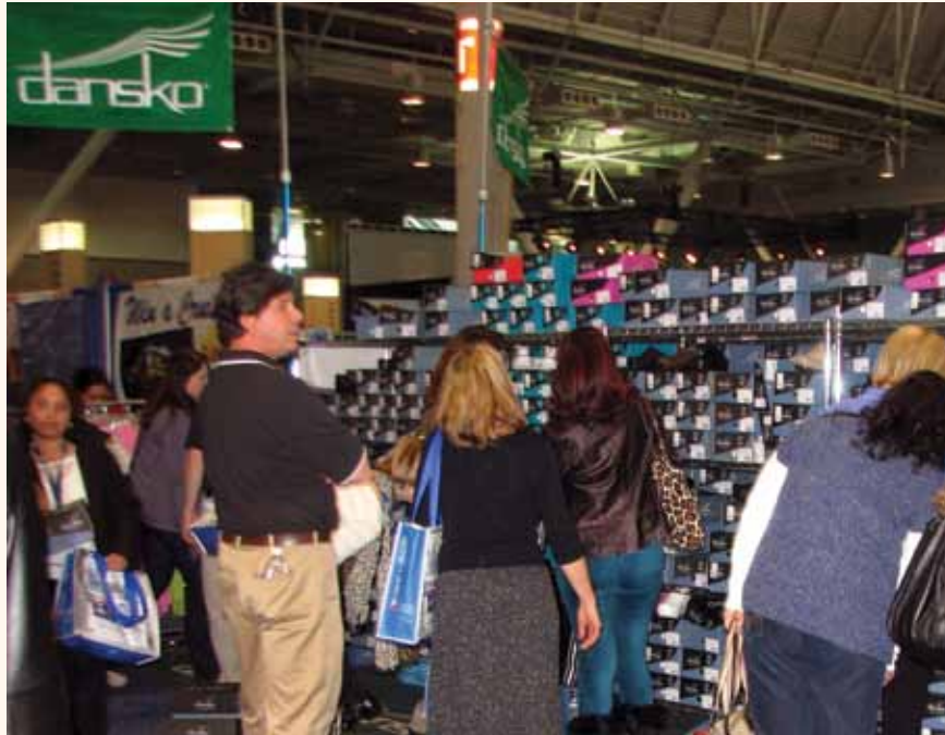
Comfy feet are happy feet, and if you need a pair of shoes, swing by the Dansko booth (No. 1248) to find a style that suits you.

The exhibit hall is open until 5:30 p.m. today and 4:30 p.m. on Saturday. Be sure to set aside extra time for a leisurely stroll through the aisles to find the new products and companies you may not yet be aware of; you'll be glad you did.