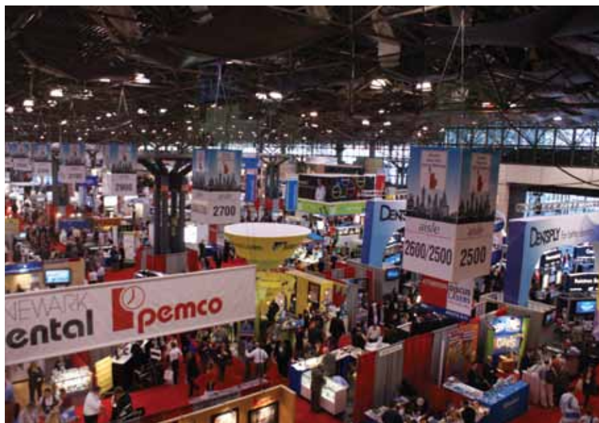
• The exhibit hall will be open this year from Sunday through Wednesday.