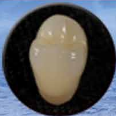
Acrylic Metal-Free Replica Crown