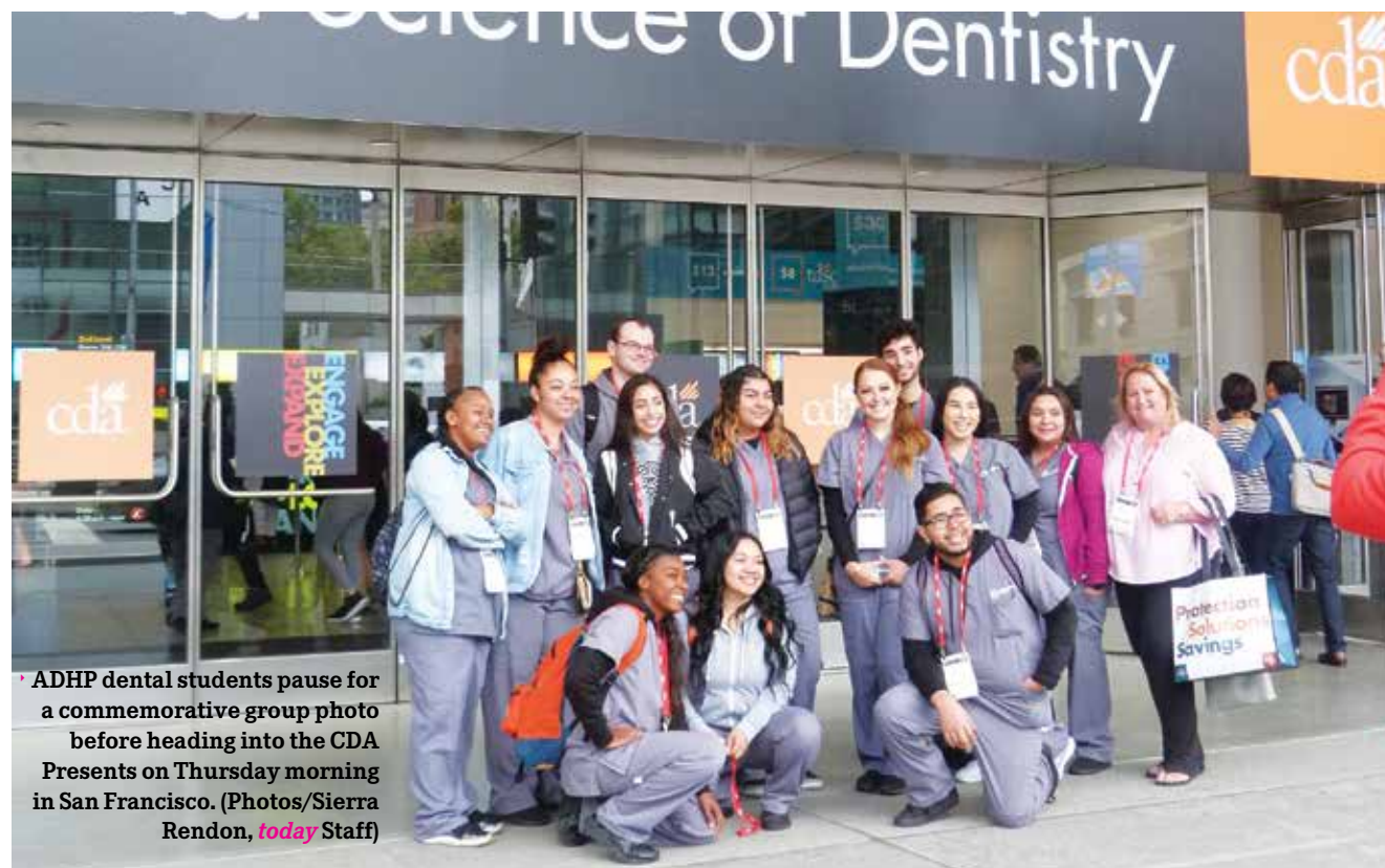
ADHP dental students pause for a commemorative group photo before heading into the CDA Presents on Thursday morning in San Francisco.