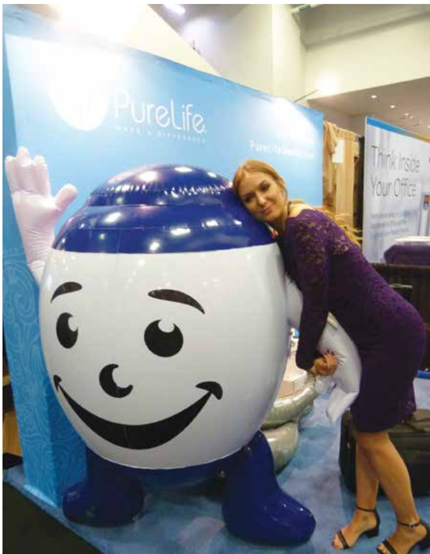
• Want to win an Apple Watch or other fun prizes? Stop by PureLife Dental, booth Nos. 808/1609, and take a picture with this cuddly guy (ECO II Man). Then post it to Twitter or Instagram with #eco2man and #cdaSF, and you could win big!