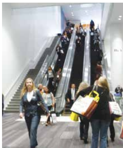
• Attendees head from educational courses to the exhibit hall Thursday morning at CDA Presents.