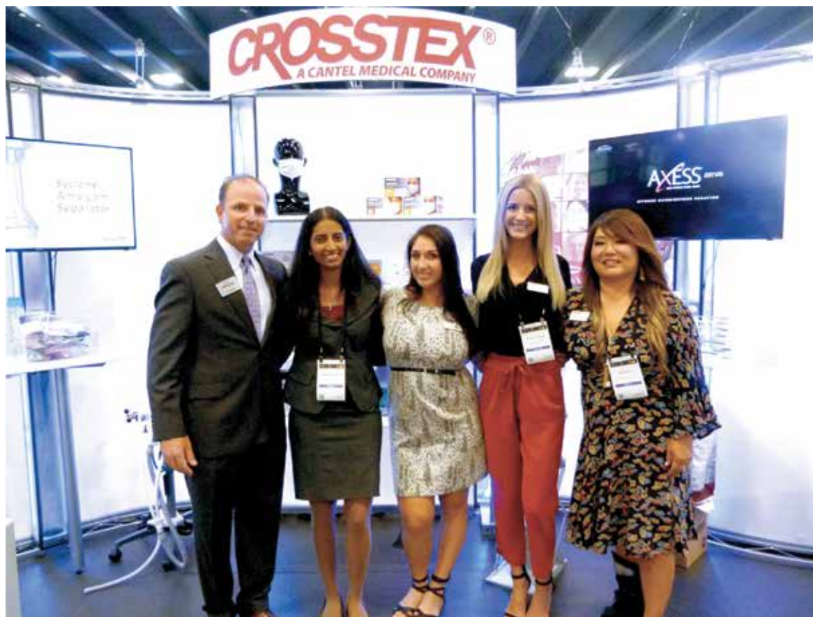
• Visit the team at Crosstex, booth No. 1412, to see all the company's newest products.