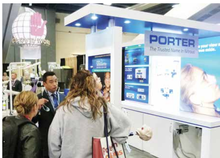
• Learn about an easier way to deliver nitrous oxide at the Porter Instrument booth, No. 1628.