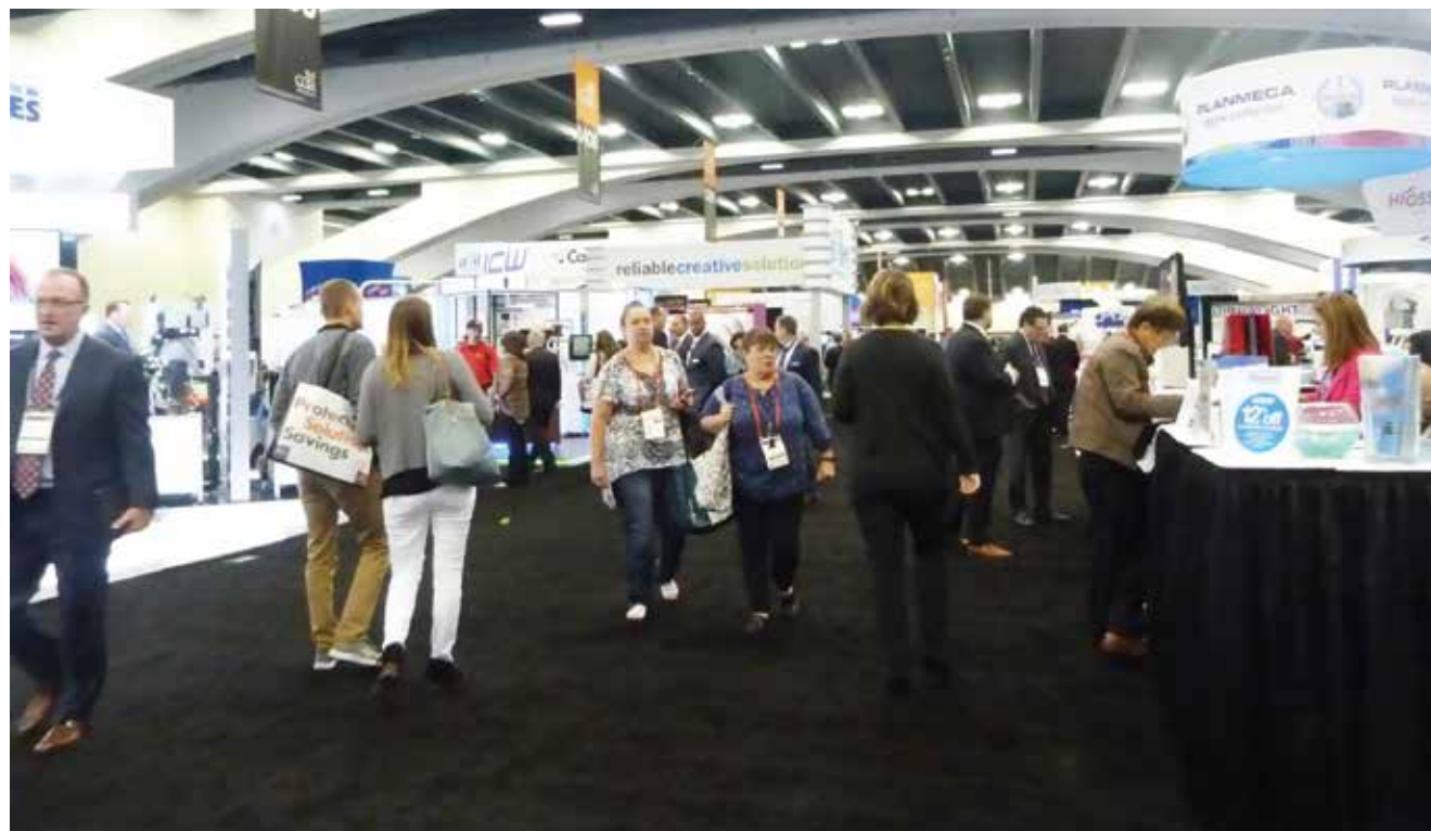
Attendees stream through the aisles of the exhibit hall Thursday at CDA Presents.

Opinions expressed by authors are their own and may not reflect those of Tribune America or Dental Tribune International.