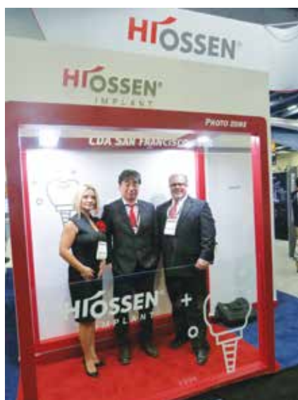
• Stop and take a picture in the photo booth at the HiOssen booth, No. 1234, to mark your CDA trip.