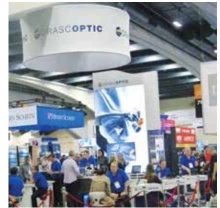
• The Orascoptic booth, No. 702, stays busy Thursday in the exhibit hall.