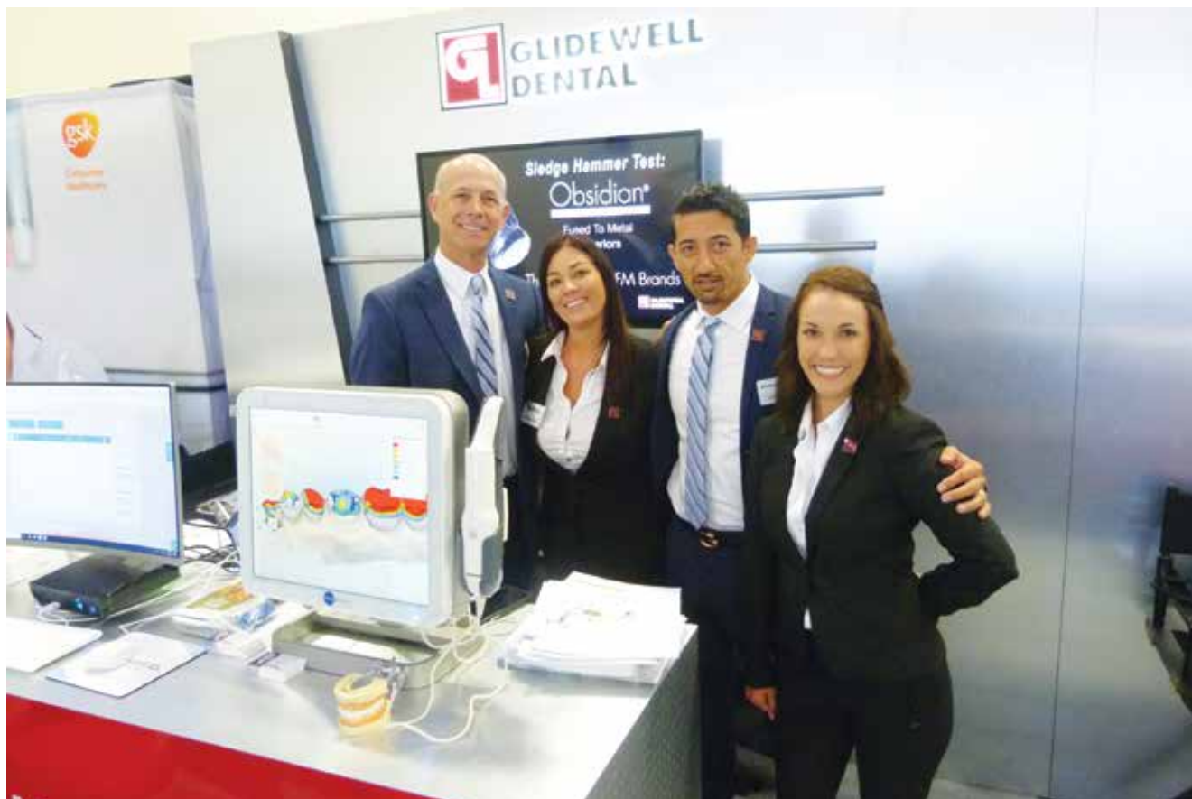
• Visit Glidewell Dental, booth No. 1303, to experience the glidewell.io solution, offering a way to make one-appointment restorative dentistry simple, flexible and affordable.