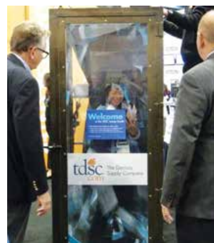
• A CDA attendee takes a whirl in the TDSC Money Booth, No. 811. Try your hand at it, and win dental supplies, gifts and promotional items.