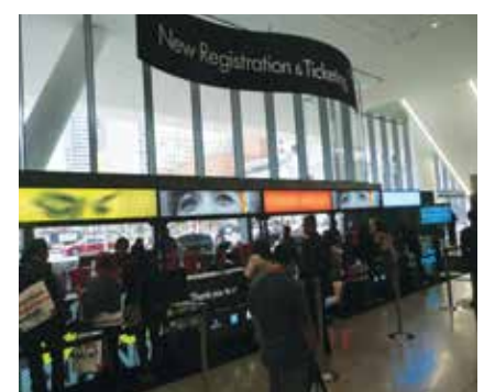
• CDA Presents registration continues through Saturday, with plenty of educational opportunities available each day.