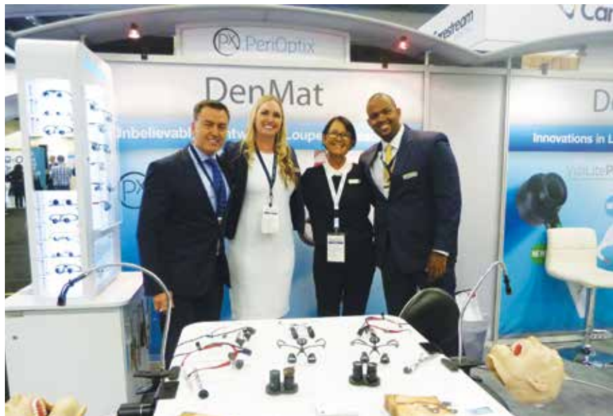
• Ask any of these friendly faces about DenMat's show specials, including a special Hartzell Instruments giveaway, at booth No. 1018.