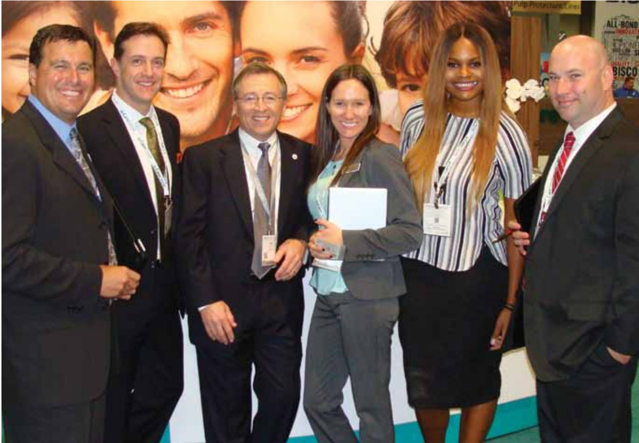
• They're all smiles at CareCredit (booth No. 1129).