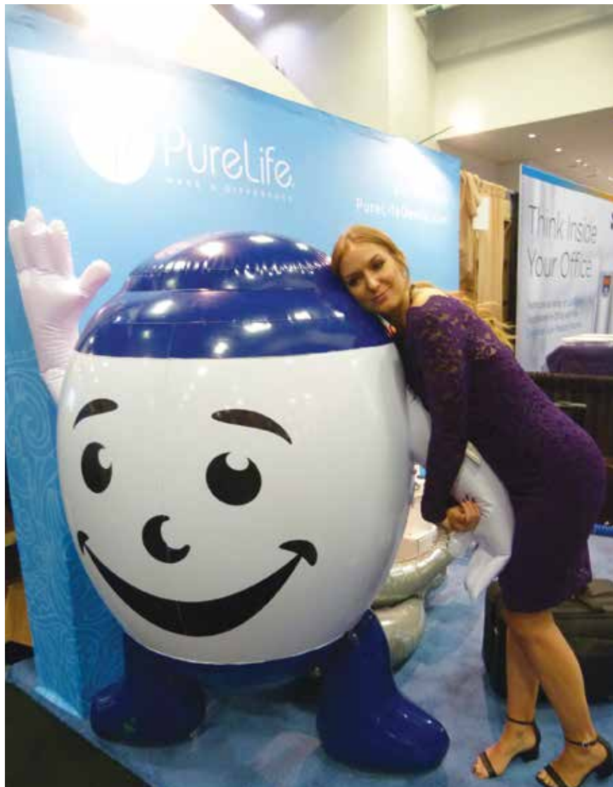
• Want to win an Apple Watch or other fun prizes? Stop by PureLife Dental, booth Nos. 808/1609, and take a picture with this cuddly guy (ECO II Man). Then post it to Twitter or Instagram with #eco2man and #cdaSF, and you could win big!