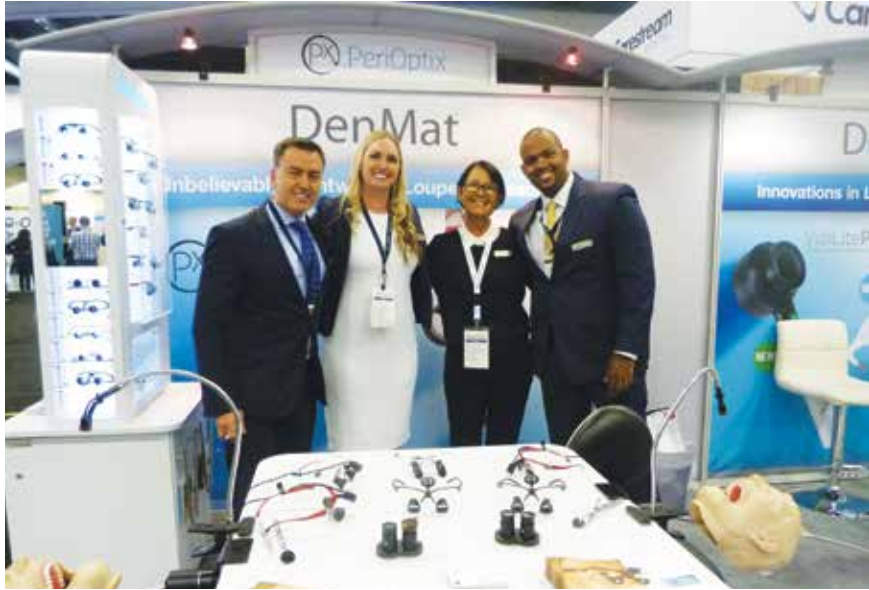
• Ask any of these friendly faces about DenMat's show specials, including a special Hartzell Instruments giveaway, at booth No. 1018.