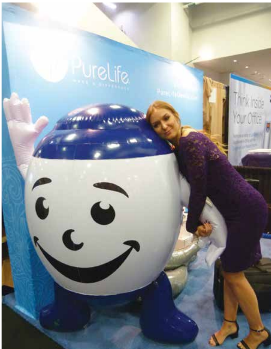
• Want to win an Apple Watch or other fun prizes? Stop by PureLife Dental, booth Nos. 808/1609, and take a picture with this cuddly guy (ECO II Man). Then post it to Twitter or Instagram with #eco2man and #cdaSF, and you could win big!