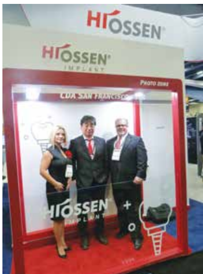
• Stop and take a picture in the photo booth at the HiOssen booth, No. 1234, to mark your CDA trip.