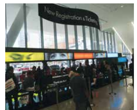
• CDA Presents registration continues through Saturday, with plenty of educational opportunities available each day.