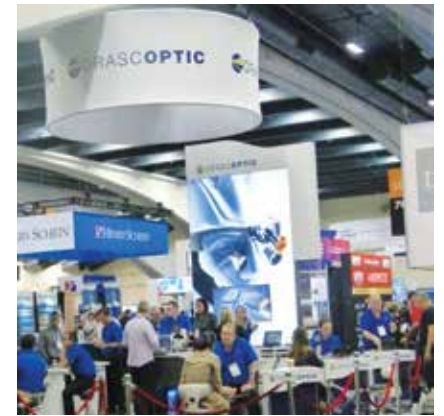
• The Orascoptic booth, No. 702, stays busy Thursday in the exhibit hall.