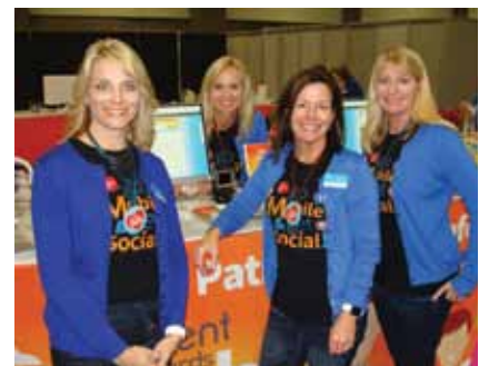
• The marketing geniuses at PracticeGenius/Patient Rewards Hub (booth No. 1655) have plenty of tools for dental practices.