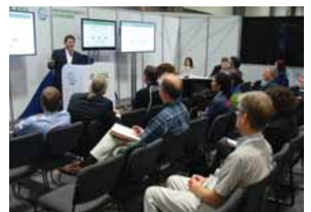
• Meeting attendees learn about interoperability standards during an educational presentation on the exhibit hall floor.