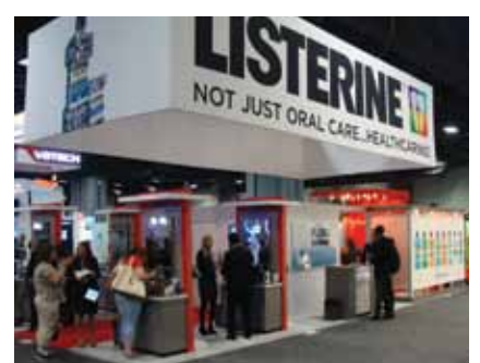
• Johnson & Johnson Consumer (booth No. 737).