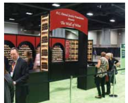
• The D.C. Dental Society Foundation presents the Wall of Wine on the exhibit hall floor.