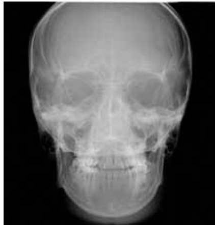
The GXDP-700 offers the opportunity for 2-D panoramics, cephalometrics and 3-D imaging.

For more information on Gendex technology, stop by booth No. 1217.