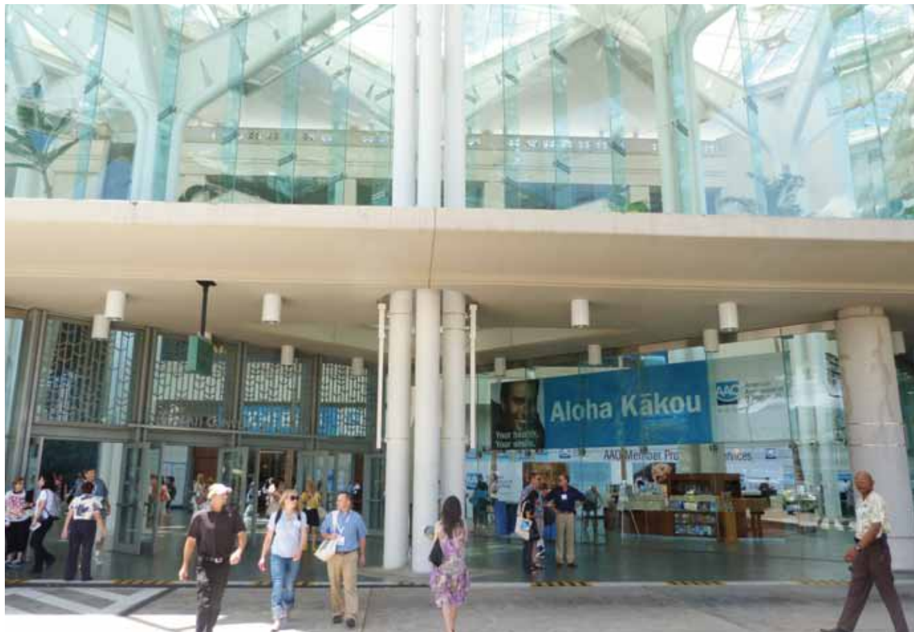
Attendees of the 12th American Association of Orthodontists' Annual Meeting head Saturday into the Honolulu Convention Center.