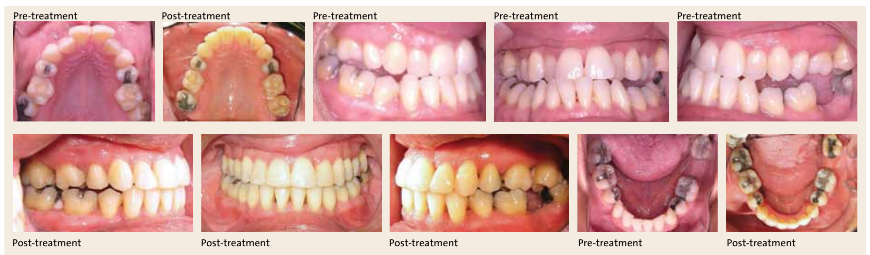
Case No. 2.