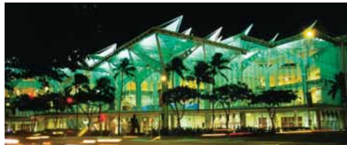
The Hawaii Convention Center at night.

On-site orders will be available for $158 (includes shipping).