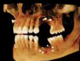
FOV 9 x 11 cm