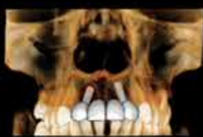
FOV 6 x 9 cm