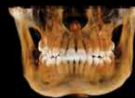
FOV 9 x 14 cm

Schedule a demo today at go.kavokerr.com/401375