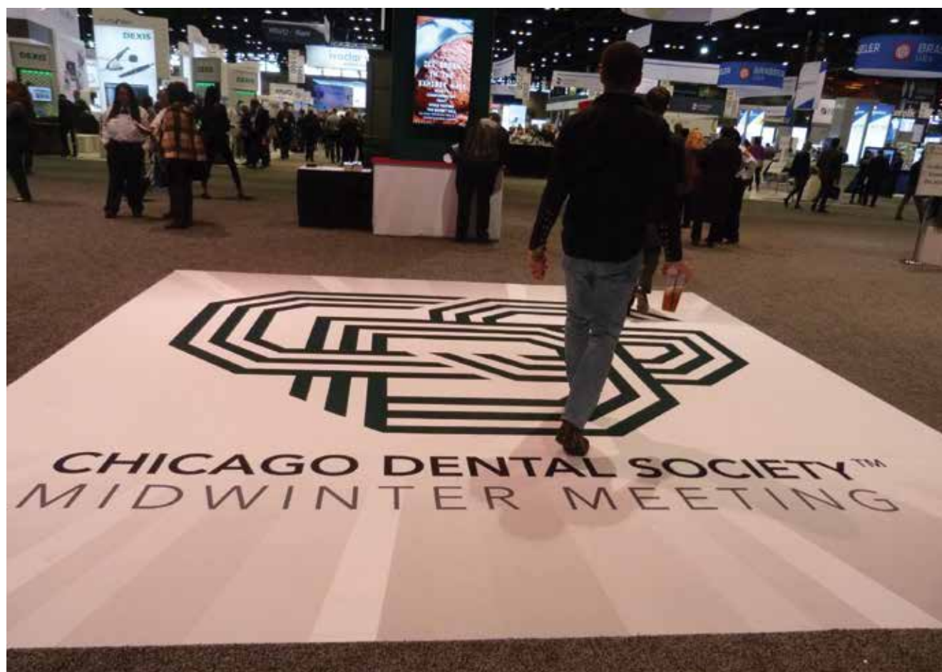
Attendees enter the Chicago Midwinter Meeting exhibit hall Thursday morning.

Opinions expressed by authors are their own and may not reflect those of Tribune America or Dental Tribune International.