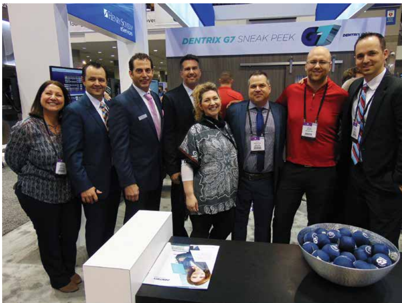
• The folks from Henry Schein eServices (booth No. 2819) are eager to tell you about Dentrix G7.