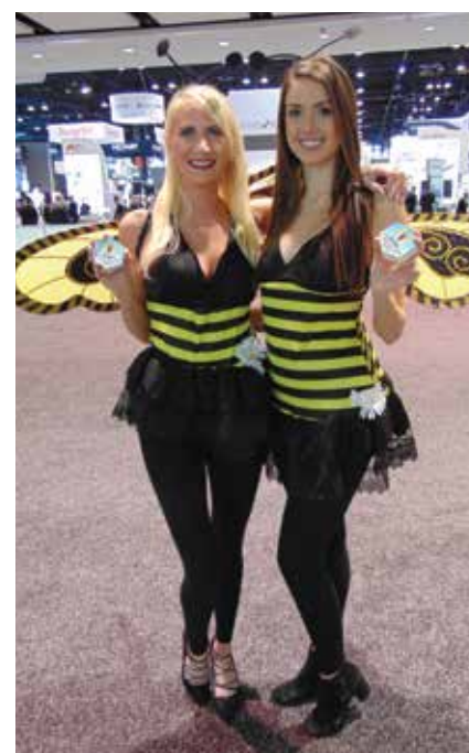
• To learn about a PDL injection without the needle, visit NumBee (booth No. 628). It's all the buzz, according to these busy bees who were buzzing about the exhibit hall Thursday morning.