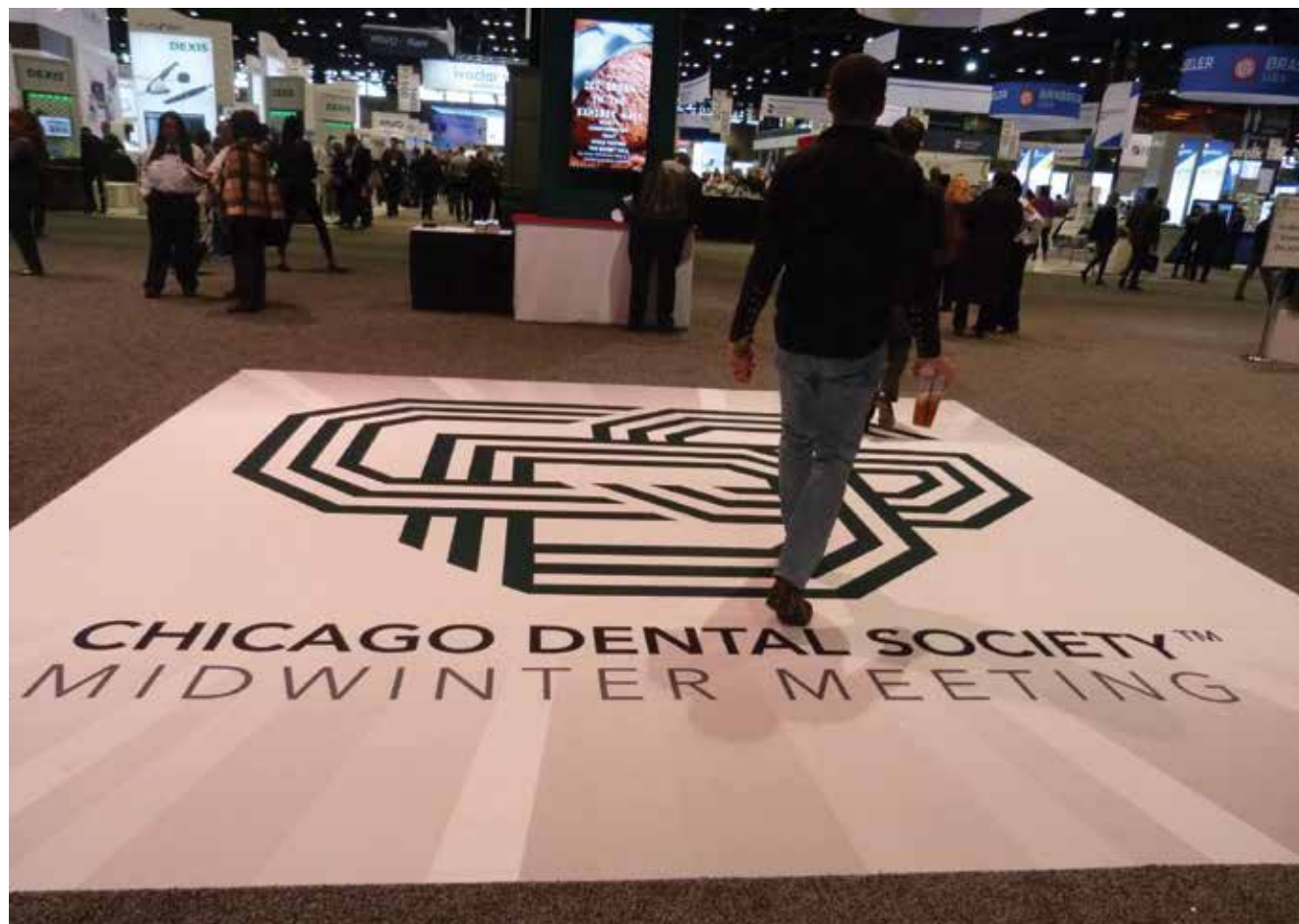
Attendees enter the Chicago Midwinter Meeting exhibit hall Thursday morning.

Opinions expressed by authors are their own and may not reflect those of Tribune America or Dental Tribune International.