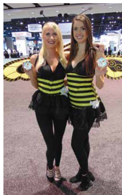
• To learn about a PDL injection without the needle, visit NumBee (booth No. 628). It's all the buzz, according to these busy bees who were buzzing about the exhibit hall Thursday morning.