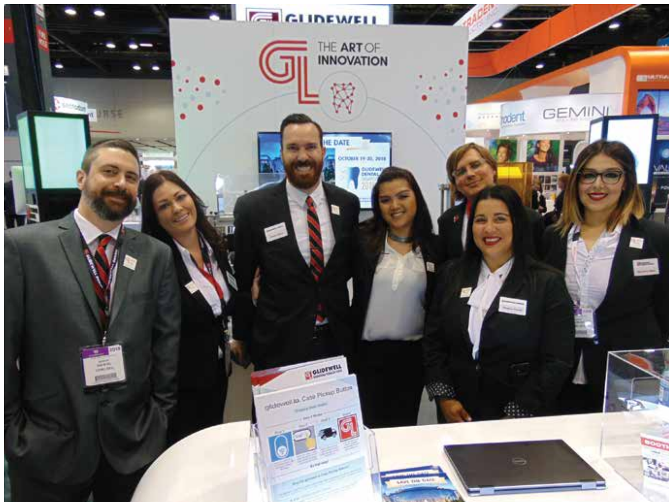
• There are big smiles all around among the team at Glidewell Dental (booth No. 4016).