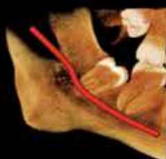
FOV 5 x 5 cm

From endo to airway studies, the new KaVo OP™ 3D is a flexible and affordable system that makes obtaining the right image achievable. With an intuitive interface, automated protocols, and customizable fields of view—plus the ability to take standard or pediatric 2D panoramic images, the KaVo OP 3D is the right system for your practice, both now and in the future.