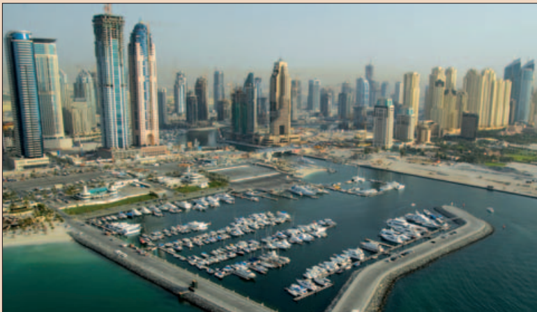
An online information network will connect health facilities in Dubai (picture) and other Emirates until 2011.

DUBAI, United Arab Emirates: With the implementation of Wareed, the new health information system for the United Arab Emirates, hospitals and clinics in the country will be connected via an online network by 2011 to improve medical care and ensure patient safety, a Ministry of Health official told Dental Tribune in November.