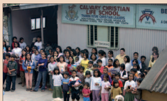
Christian school in the Philippines

The Philippines is one of the Third World countries with the most alarming child dental problems. According to the Department of Education's recent National Oral Health Survey of six- and twelve-