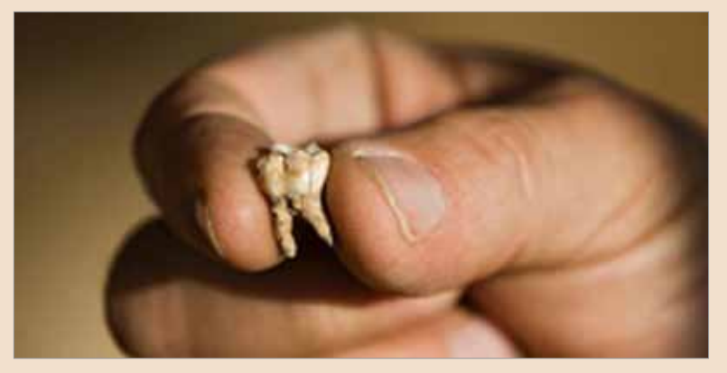
Teeth hold the key to bacterial change history

"Genetic analysis of plaque can create a powerful new record of dietary impacts, health changes and oral pathogen genomic evolu-