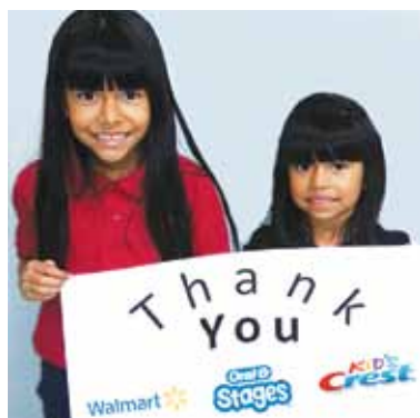
• America's ToothFairy Smile Drive promotes family oral health.

■ Designed to raise awareness and collect oral care products for at-risk children and teens, the America's ToothFairy Smile Drive is being held this month, which is National Children's Dental Health Month.