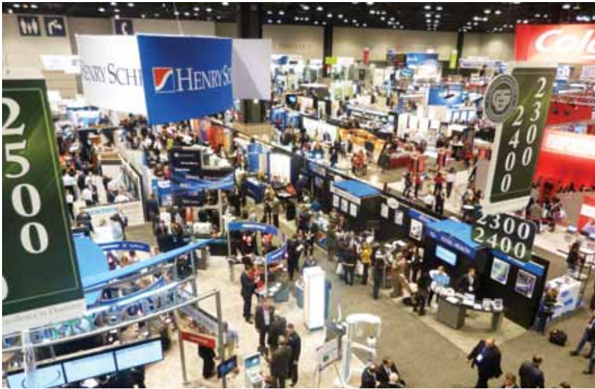
• Attendees stream through the aisles of the Chicago Midwinter 2013 Exhibit Hall to check out the latest innovations from hundreds of exhibitors.