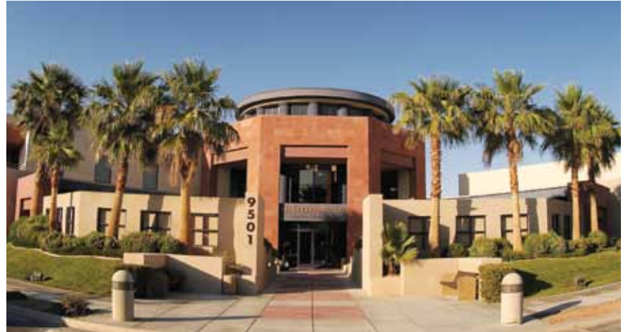
Las Vegas Institute for Advanced Dental Studies offers Core I, a three-day course for doctors and their teams.