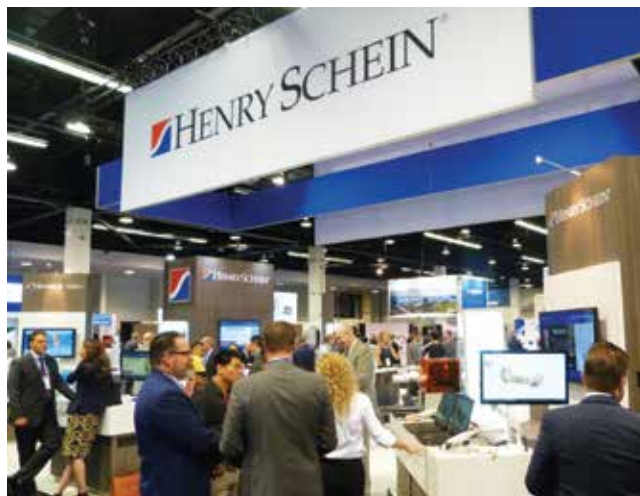
• The Henry Schein booth, No. 1362, has a wide variety of in-booth presentations and demonstrations you won't want to miss.