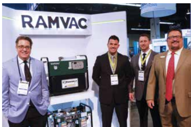
• The DentalEZ team is ready to introduce you to the RAMVAC at booth No. 416.