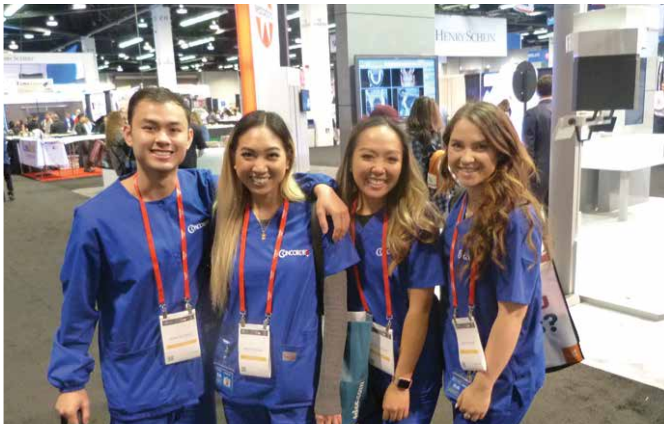
• Concord Career College, Garden Grove, students in the dental assistant program enjoy checking out the hundreds of CDA exhibit hall booths on Thursday.