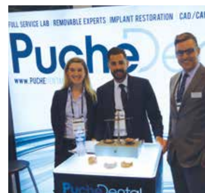
• Be sure to see the Puche Dental team at the booth, No. 590, where you can also check out Solvay's Ultaire AKP.