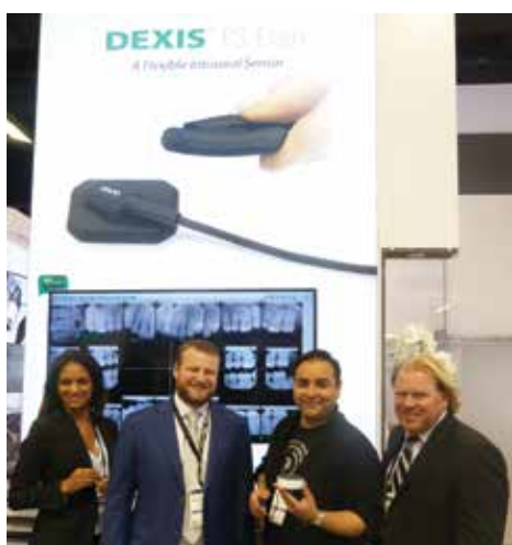
• Be sure to ask about the new DEXVoice hands-free option at Dexis, booth No. 1535.