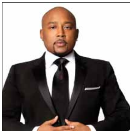
• Daymond John, star of ABC's 'Shark Tank,' will be the special guest speaker at today's first SIROWORLD Celebration event, being held at the TimesCenter in the Times Square District.