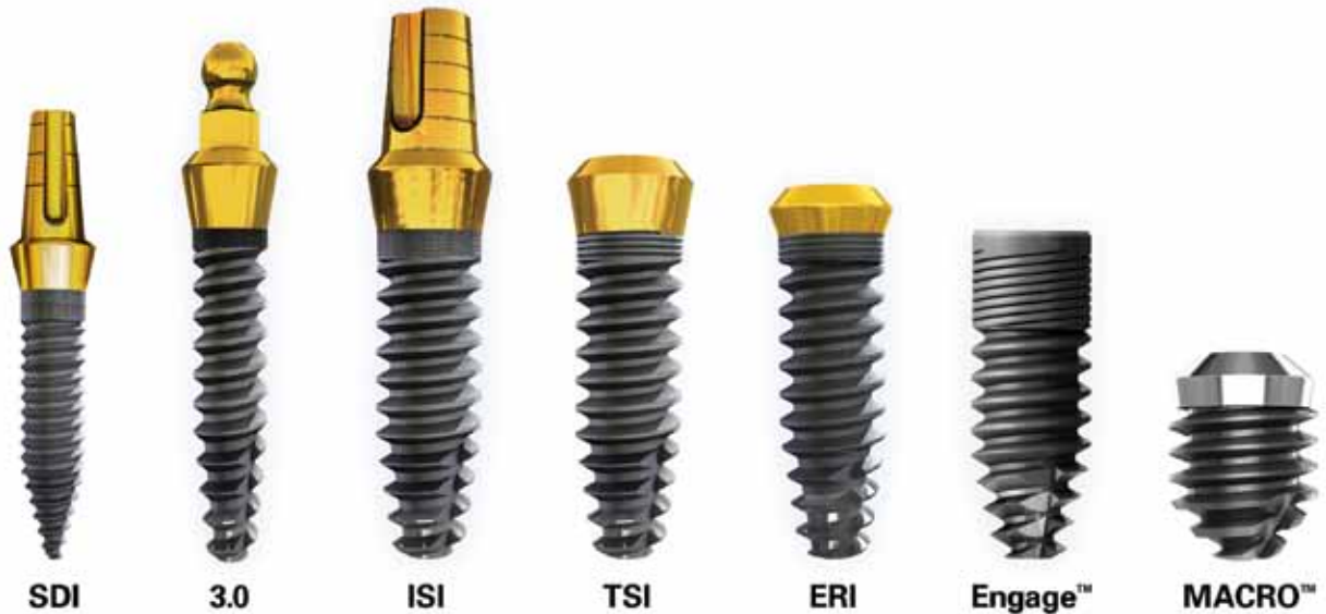
• OCO Biomedical's Dental Implant System.