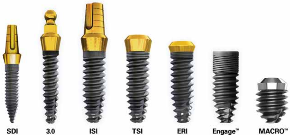
• OCO Biomedical's Dental Implant System.