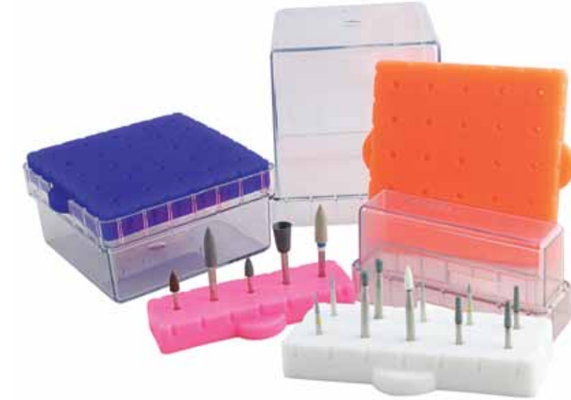
• Shofu's BurButler is a system for storage, sterilization and organization of dental burs that grips CA, FG, HP and short-shank burs all in one block.

The base comes in five assorted colors – amber orange, amethyst