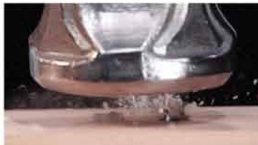
Crowns hit with sledgehammer