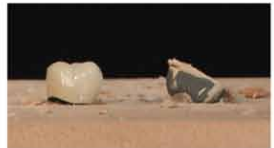
Obsidian (left), Ceramco3 (right)

*Price does not include shipping or applicable taxes. †Data provided by Glidewell Laboratories Research and Development Department, 2015. Ceramco is a registered trademark of DENTSPLY Ceramco.