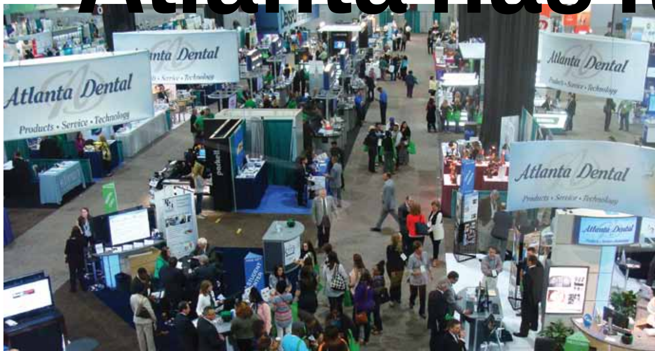
• Products, service and technology are available from Atlanta Dental Supply (booth No. 1311) — and hundreds of other exhibiting companies — here at the 104th Thomas P. Hinman Dental Meeting.