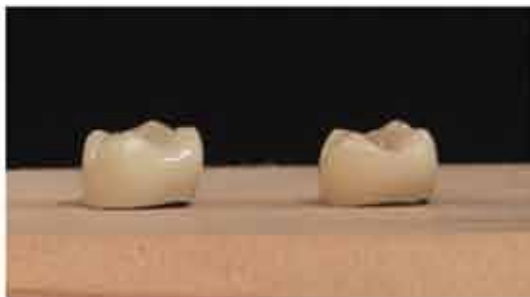
Obsidian (left), Ceramco3 (right)