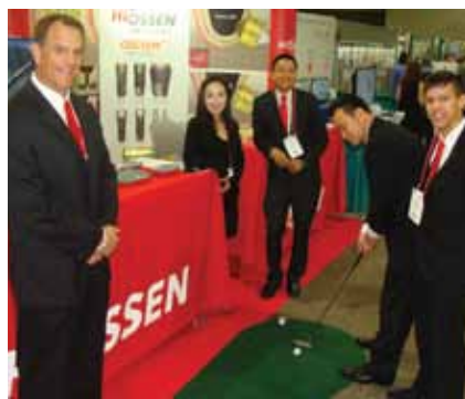
• The folks at Hiossen (booth No. 1038) make use of their putting green.