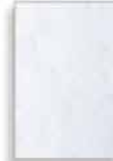
20mm x 30mm

Extra 5mm Length Allows Buccal-Lingual Coverage