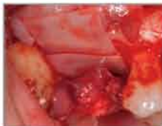
Renovix® Placed Double Layer