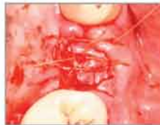
Sutured Without Primary Closure