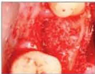
Grafted Extraction Socket