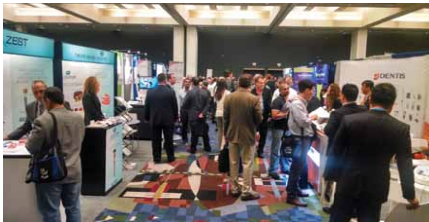
Attendees make their way through the aisles Thursday afternoon in the ICOI exhibit hall.

Over in the exhibit hall, 70-plus companies are waiting to give you demonstrations on their lat-