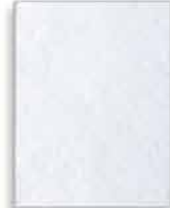
30mm x 40mm