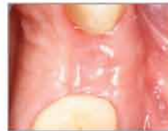
4 Week Post-Op Mature Tissue Closure