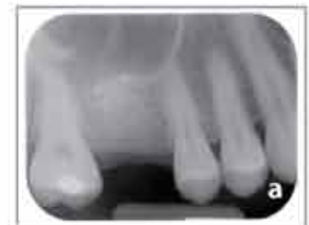
16 Week X-Ray Ideal Bone Formation