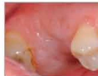
16 Week Post-Op Mature Tissue Closure