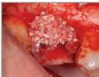
Grafted Extraction Socket