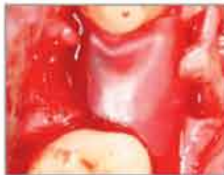
Renovix® Draped Over Surgical Site