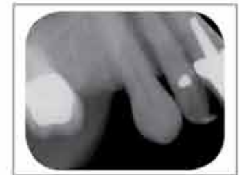
16 Week X-Ray Ideal Bone Formation