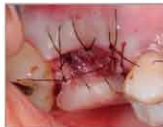
Sutured Without Primary Closure