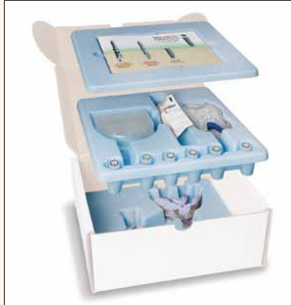
Fig. 1: Inclusive Tooth Replacement Solution