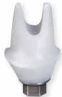
Final custom abutment included