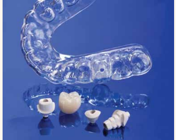
Fig. 2a: Prosthetic guide, custom temporary abutment, BioTemps provisional crown, custom healing abutment and custom impression coping