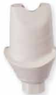
Custom temporary abutment included