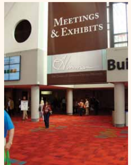
It's this way to the meetings and exhibits.