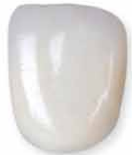
Final BruxZir® or IPS e.max® crown included