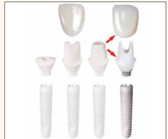
Fig. 3: Final Inclusive custom abutment and final BruxZir or IPS e.max crown