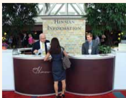
Do you have questions? They've got answers at the information booth.