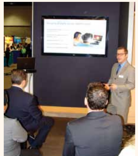
Attendees sit down for an educational presentation offered at the Carestream Dental booth (No. 1323).