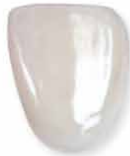
BioTemps® provisional crown included