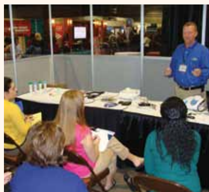
Meeting attendees learn more about products available from Patterson Dental Supply during a presentation Thursday morning on the exhibit hall floor.