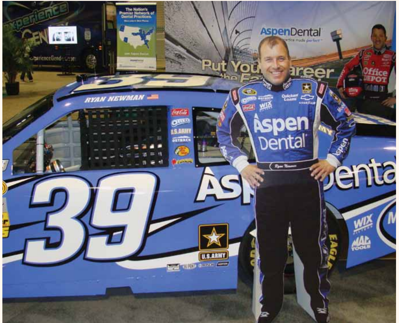
Get your picture taken with auto racing's Ryan Newman at the Aspen Dental booth (Nos. 2729/2733).