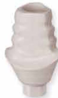
Custom impression coping included