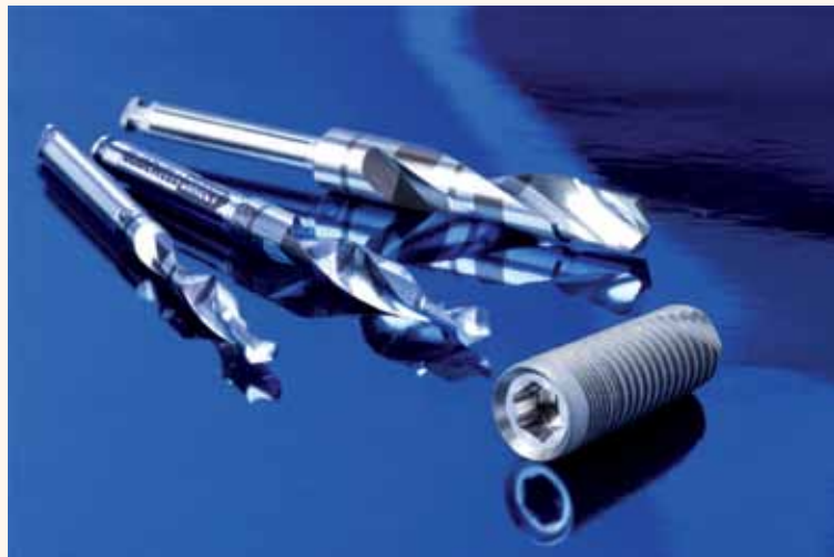
Fig. 2b: Inclusive Tapered Implant and disposable surgical drills