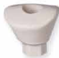
Custom healing abutment included