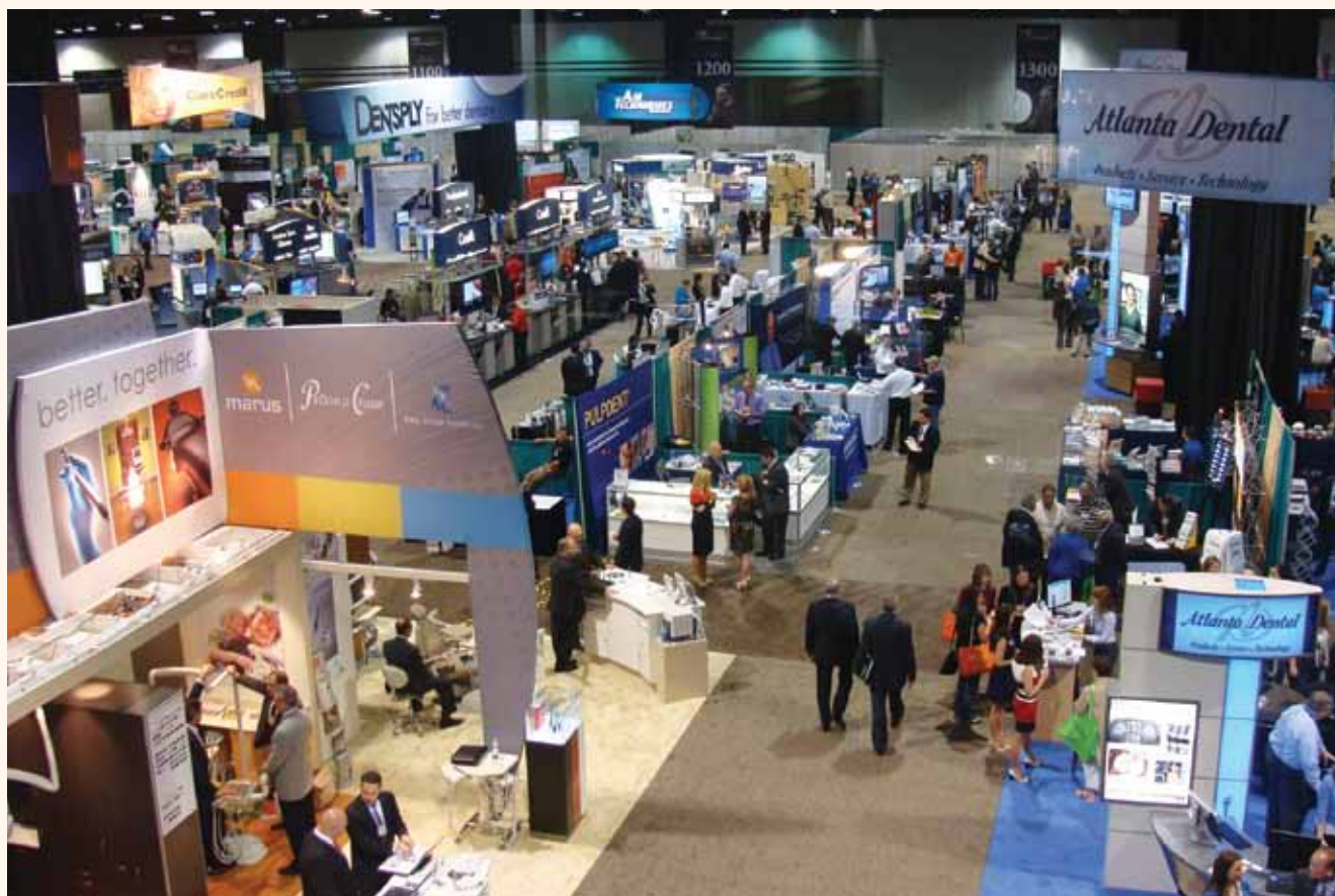
The exhibit hall floor offers plenty of opportunities.