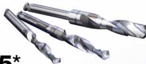
Surgical drills and Inclusive® Tapered Implant included