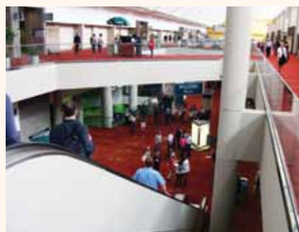
During the Hinman meeting, there's always plenty more to see and explore at the Georgia World Congress Center.