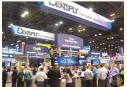
DENTSPLY's many divisions serve a variety of needs in the dental market, including implants, prosthetics and much more. Stop by the booth to learn more (No. 1802/2002).