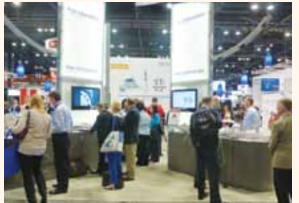
Attendees gather to hear the latest information at the Axis/SybronEndo booth (No. 3600/3801).