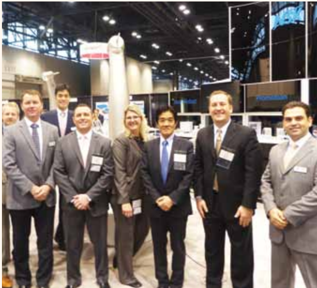
The team at NSK (booth No. 1243).