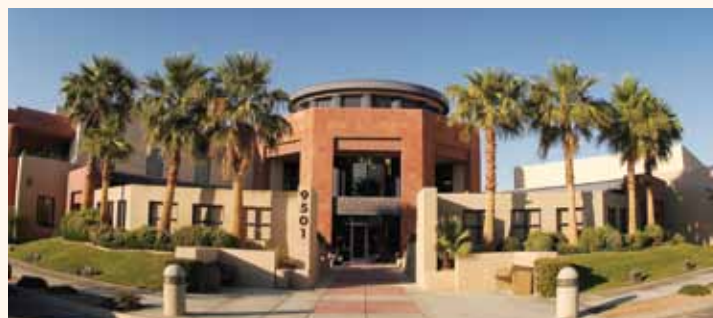
The Las Vegas Institute for Advanced Dental Studies in Las Vegas.

The Core I program at LVI is the first step on that journey. That's why when