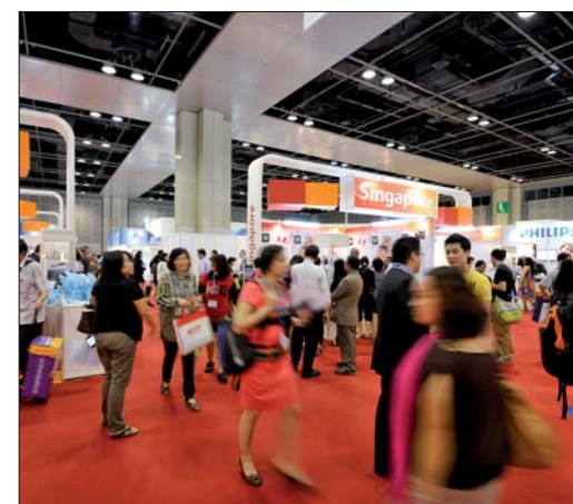
More visitors than ever were swarming the aisles of the Suntec exhibition hall in 2012