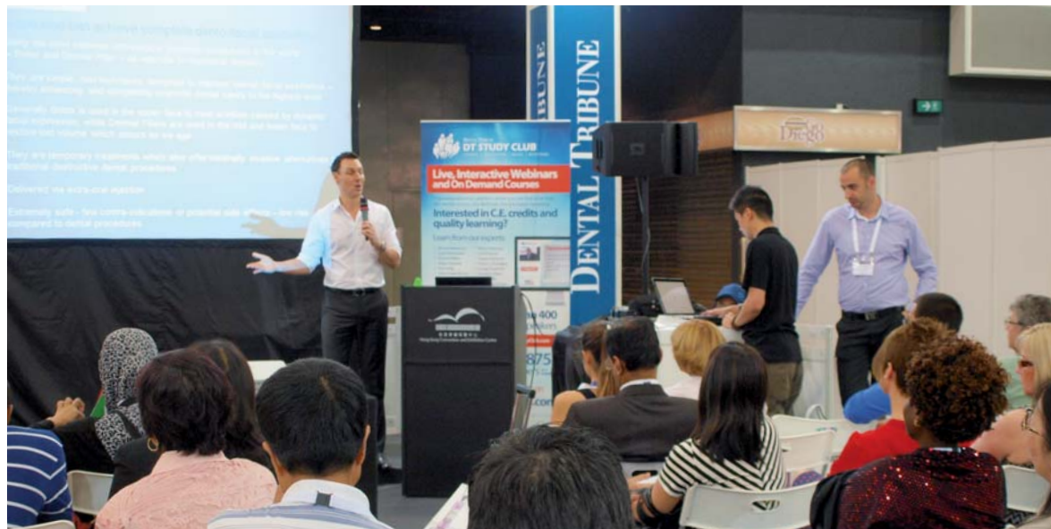
A full symposium at last year's AWDC in Hong Kong.

recognised education platform has been providing dental education to millions of dentists at international conferences and exhibitions, as well as through online lectures. More than 150,000 dentists around the world are currently members of the DT Study Club, according to DTI figures. Local platforms are available in Germany, France, Italy and Brazil,