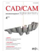
Cover image courtesy of DENTSPLY Implants (www.dentsplyimplants.com)