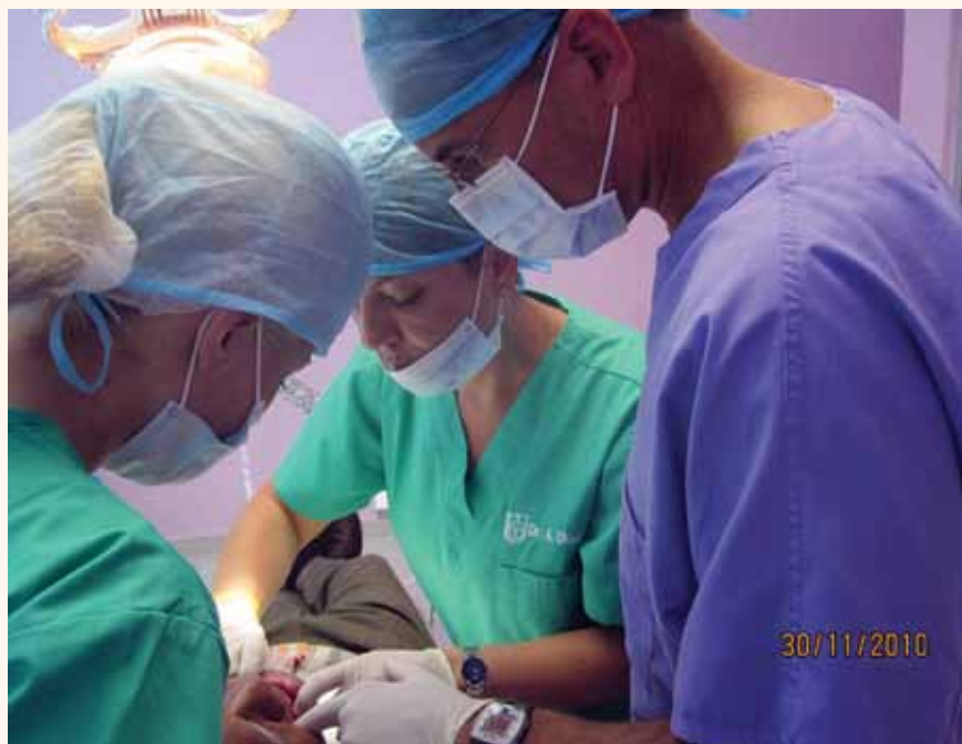
The Q-Implant Marathon team with participants in Santo Domingo.

Patients are prepared and followed-up by the resident team of the university hospital and, in most cases, are immediately provided with long-term temporary restorations so participants can see the result of the treatment and complete their photographic documentation.