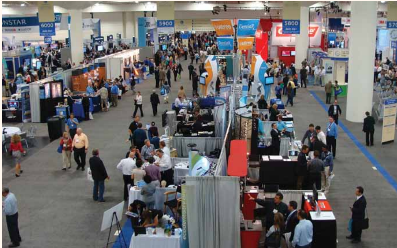
Meeting attendees explore offerings on the exhibit hall floor on Thursday, opening day of the ADA's 153rd Annual Session and World Marketplace Exhibition.