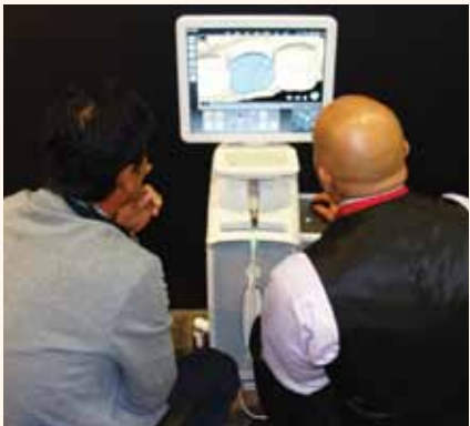
A meeting attendee sits down to learn more about E4D technology at the booth (No. 1036).