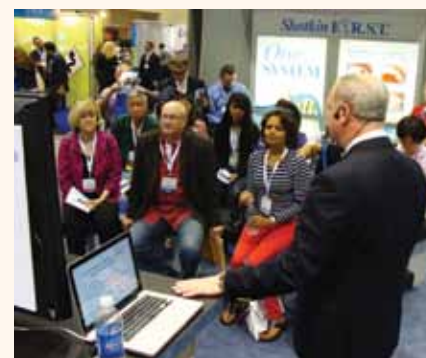
Meeting attendees learn about mini implants at Shatkin F.I.R.S.T. (booth No. 5526).