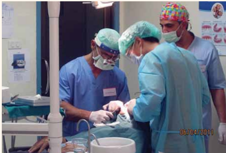
The Q-Implant Marathon team works on a patient.