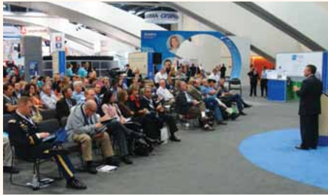
Meeting attendees listen to a presentation at the Pride Institute Technology Expo, located at the ADA CE Hub on the exhibit hall floor.