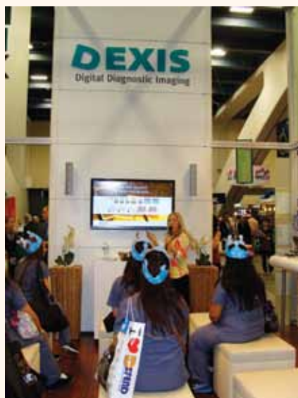
Meeting attendees listen to an educational presentation at DEXIS (booth No. 2020).