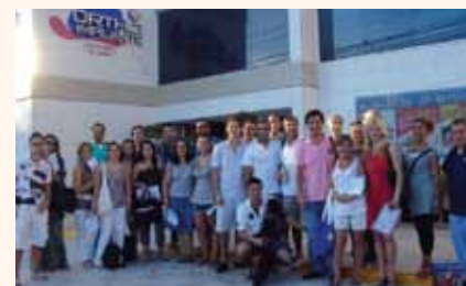
A group of Q-Implant Marathon participants in Santo Domingo.

Today, the concept has been rolled out throughout three permanent locations worldwide, with one in the Dominican Republic and two courses in Asia. In the last eight years, the Trinon Collegium Practicum has seen more than 2,000 dentists participate in the Q-Implant Marathon with more than 12,000 patients treated