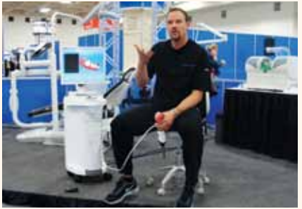
The Live Patient CAD/CAM Stage, sponsored by E4D and Patterson Dental, offers free, 90-minute courses. The demonstrations are taking place in the ADA CE Hub in Exhibit Hall C.